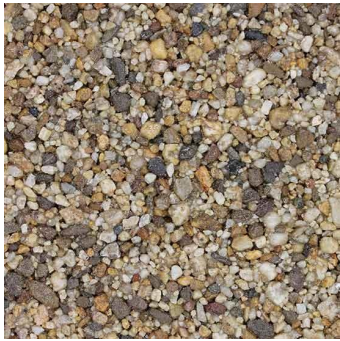
Note 5. SuDs compliant permeable resin bound paving