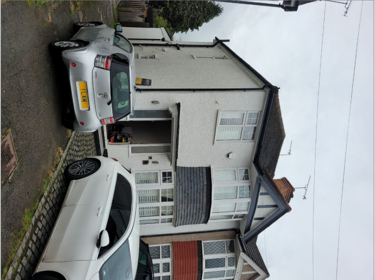
FRONT VIEW OF NO.72