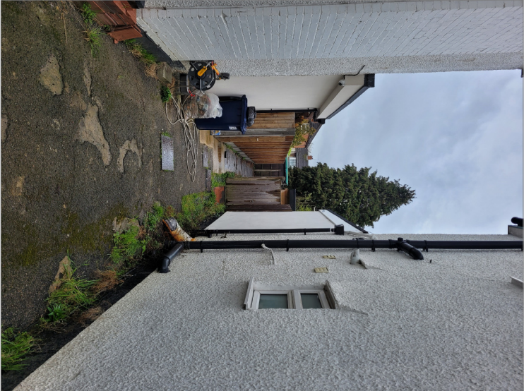
SHARED LANE WAY LEADS TO BACK GARDENS