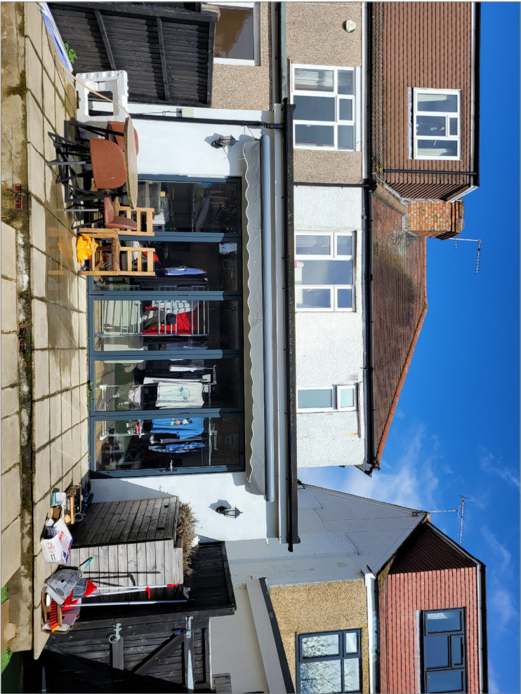
NO.72 BACK GARDEN