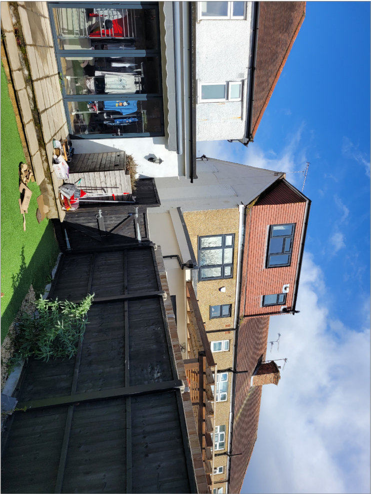
VIEW TO ADJOINING NEIGHBOUR - 74 MERTON AV. FROM NO.72 BACK GARDEN