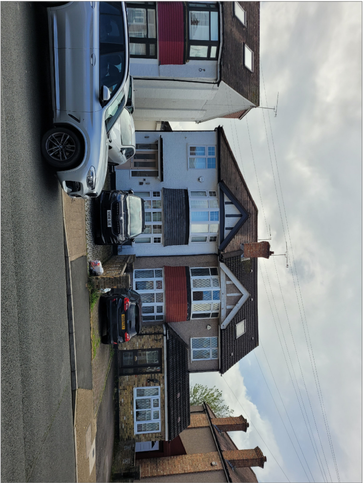
FRONT VIEW TO NO. 74, 72 & 70 MERTON AVENUE