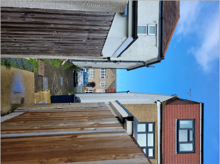
VIEW FROM THE BACK OF SHARED SIDE LANE WAY