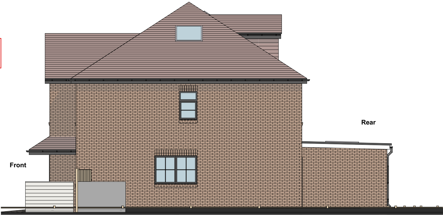
Proposed Side Elevation 1:100