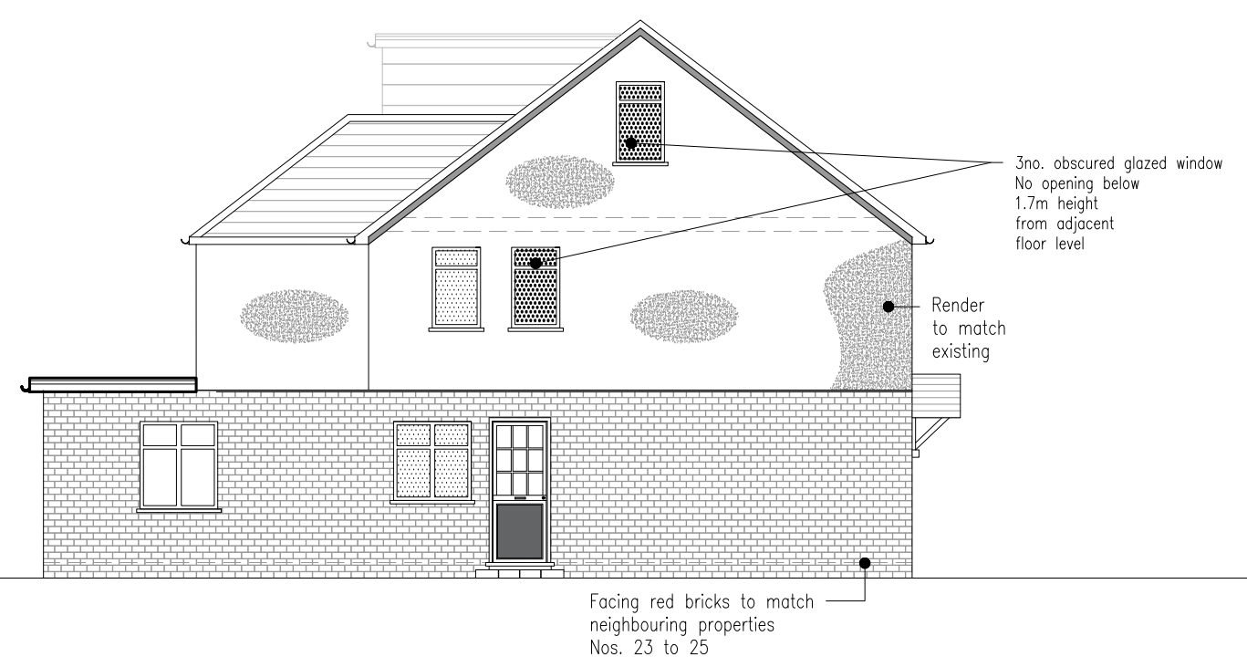
PROPOSED SIDE ELEVATION (B) Scale: 1:100