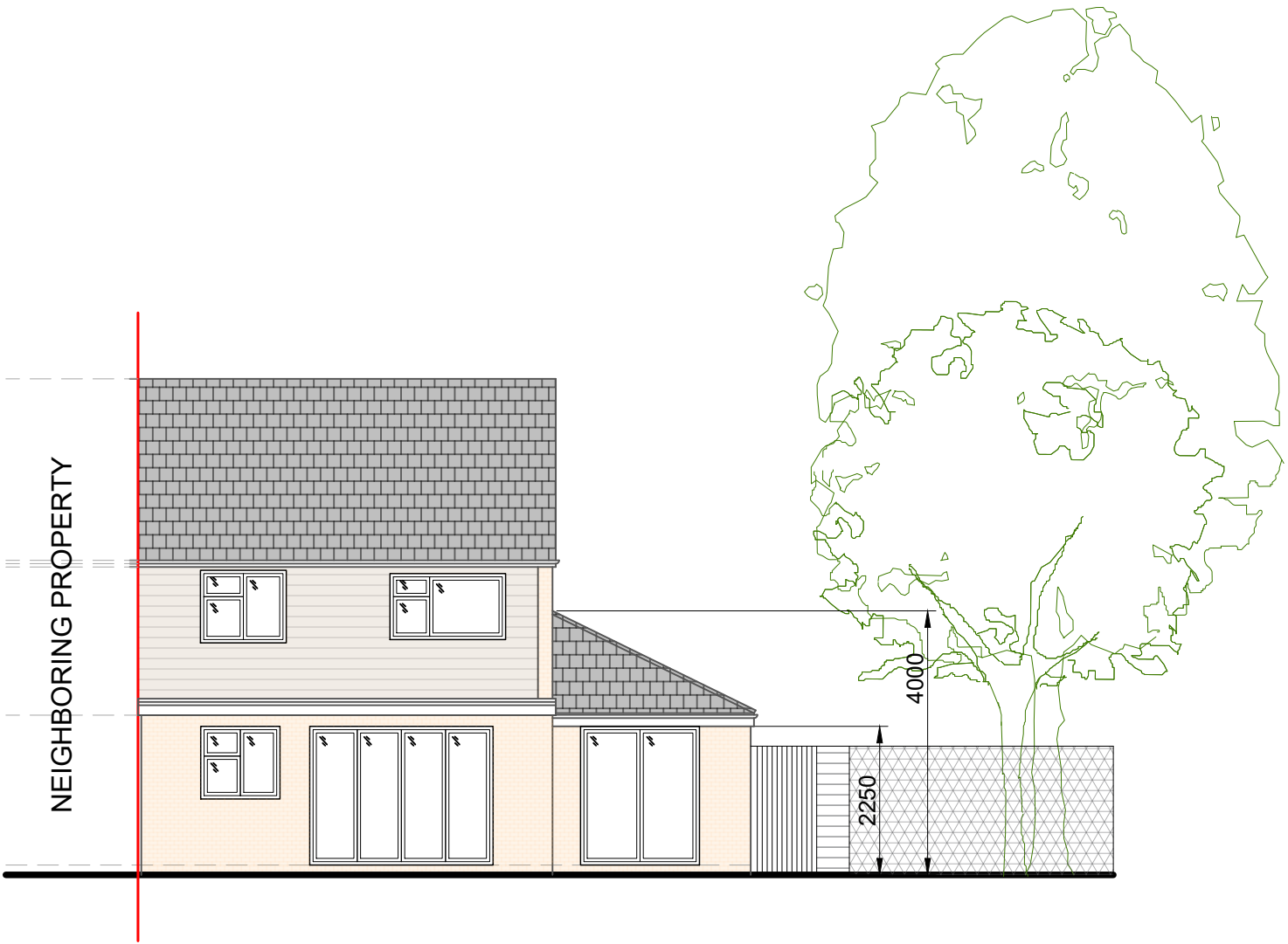
PROPOSED SIDE ELEVATION SCALE: 1:100