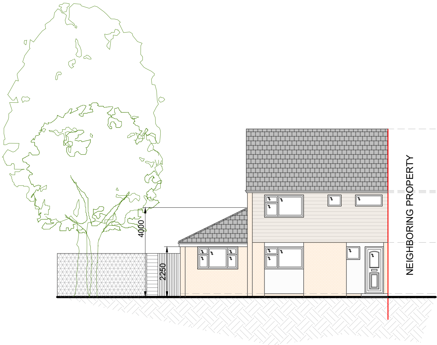
EXISTING FRONT ELEVATION (UNALTERED) SCALE: 1:100

© This drawing is the property of Oxbridge Design and Detailing Services Ltd. Copyright is reserved by them and is issued on the condition that it is not copied or disclosed by or to any unauthorised persons without the prior consent in writing. All Dimensions to be checked on site any discrepancies must be reported to Oxbridge Design and Detailing Services Ltd. prior to undertaking of any relevant works. Written dimensions to be follow in preference to scaled dimensions and all figured dimensions are millimetres unless otherwise stated.