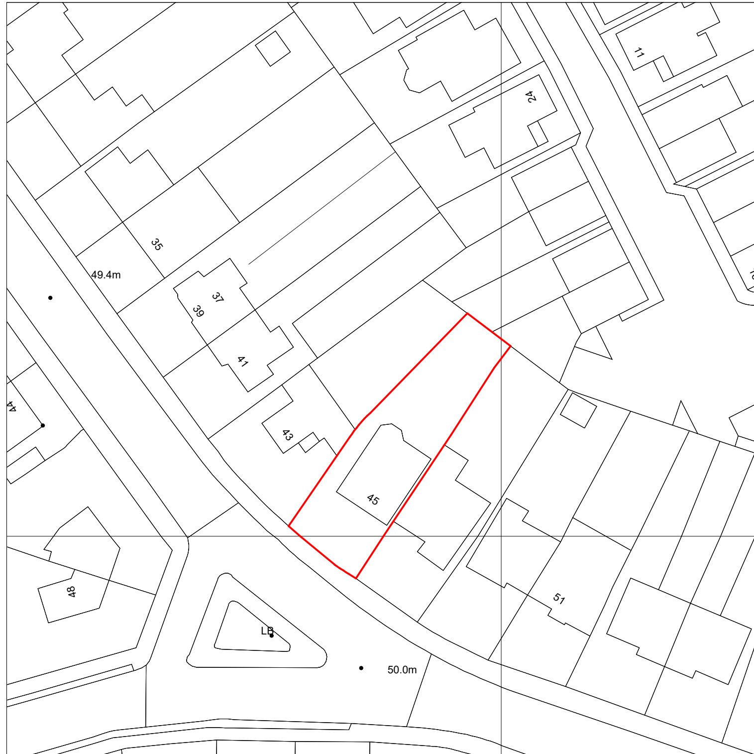
3 SITE PLAN 1: 500