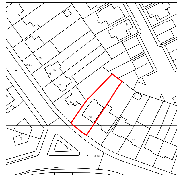
1 LOCATION PLAN 1: 1250