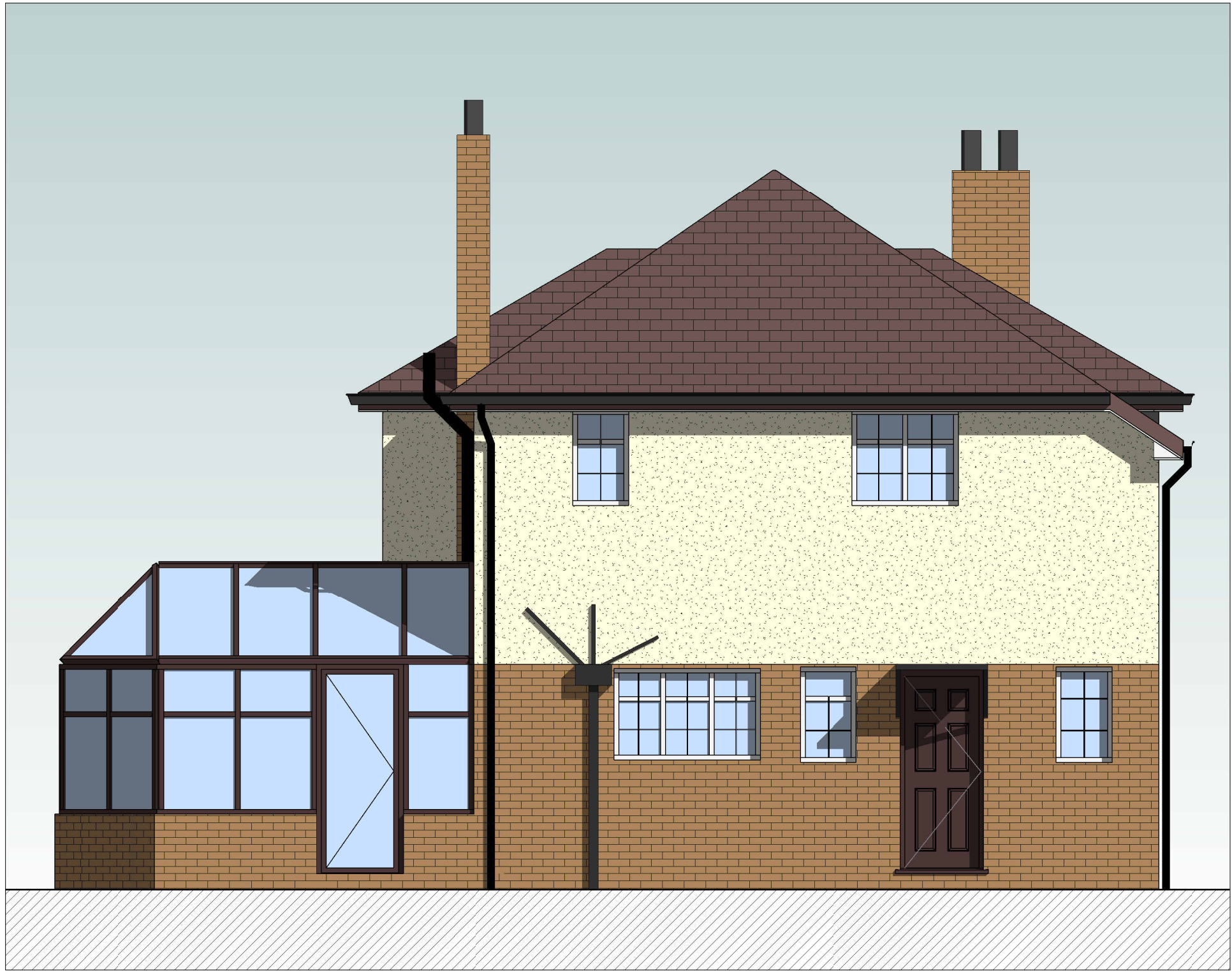
A ELEVATION A - AS EXISTING 1:50