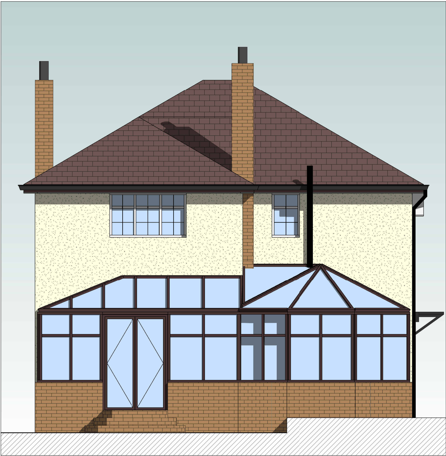
B ELEVATION B - AS EXISTING 1:50