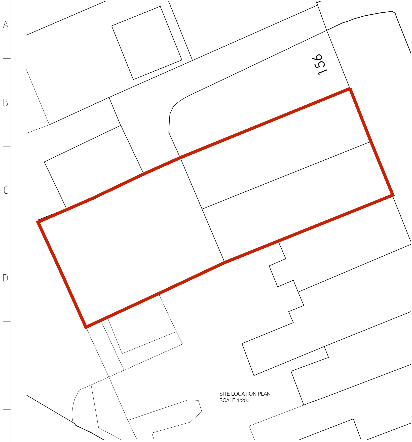
SITE LOCATION PLAN SCALE 1:200