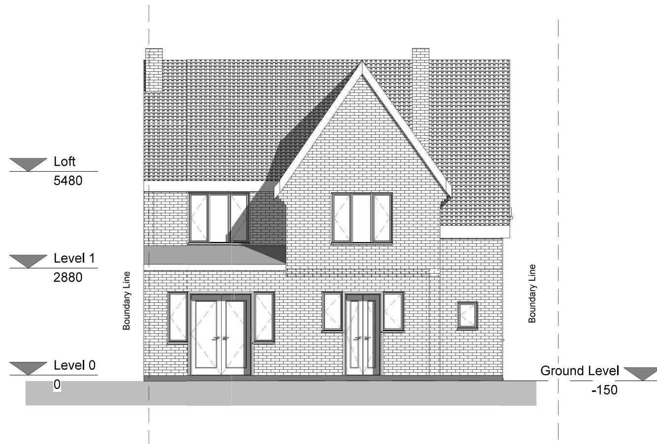
Rear elevation - Existing 1 : 100