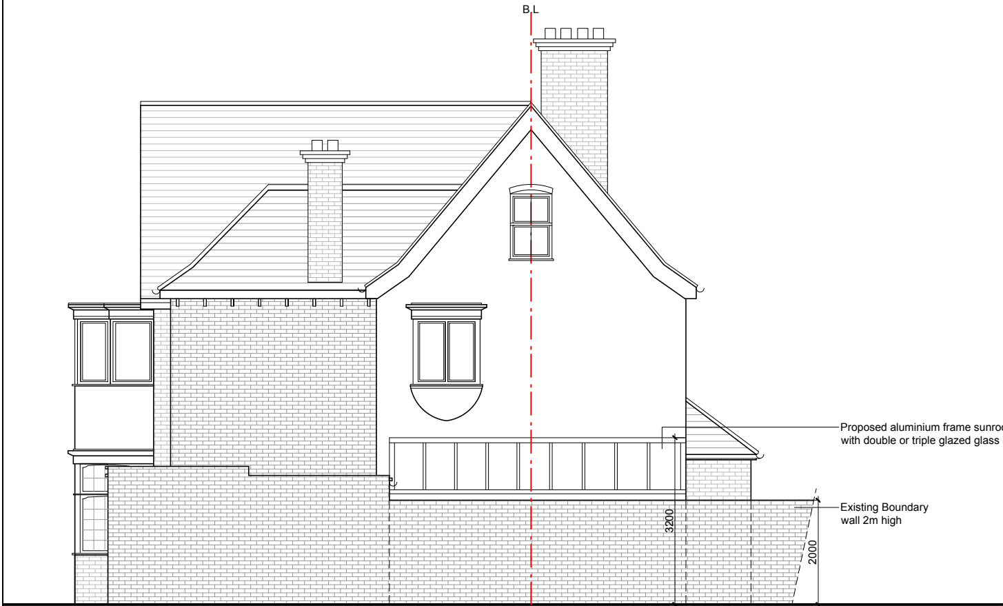
PROPOSED SIDE (RHS) ELEVATION