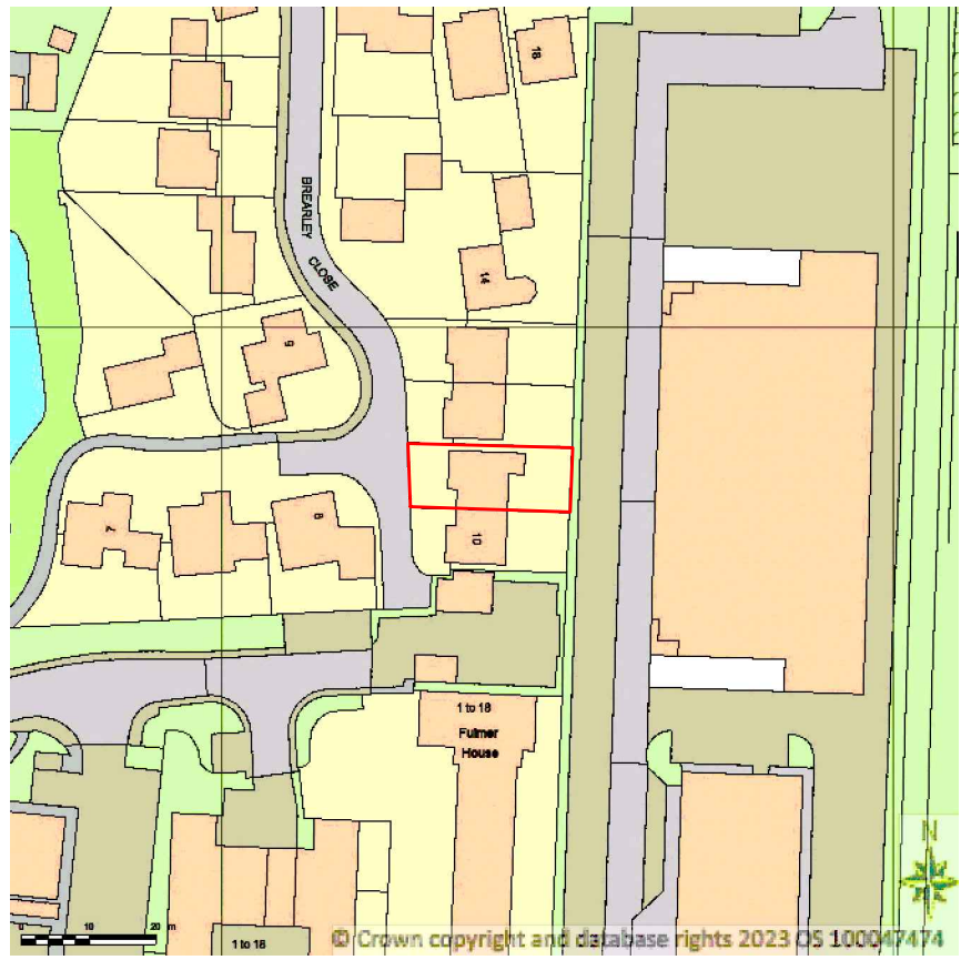
LOCATION MAP SCALE 1:1250