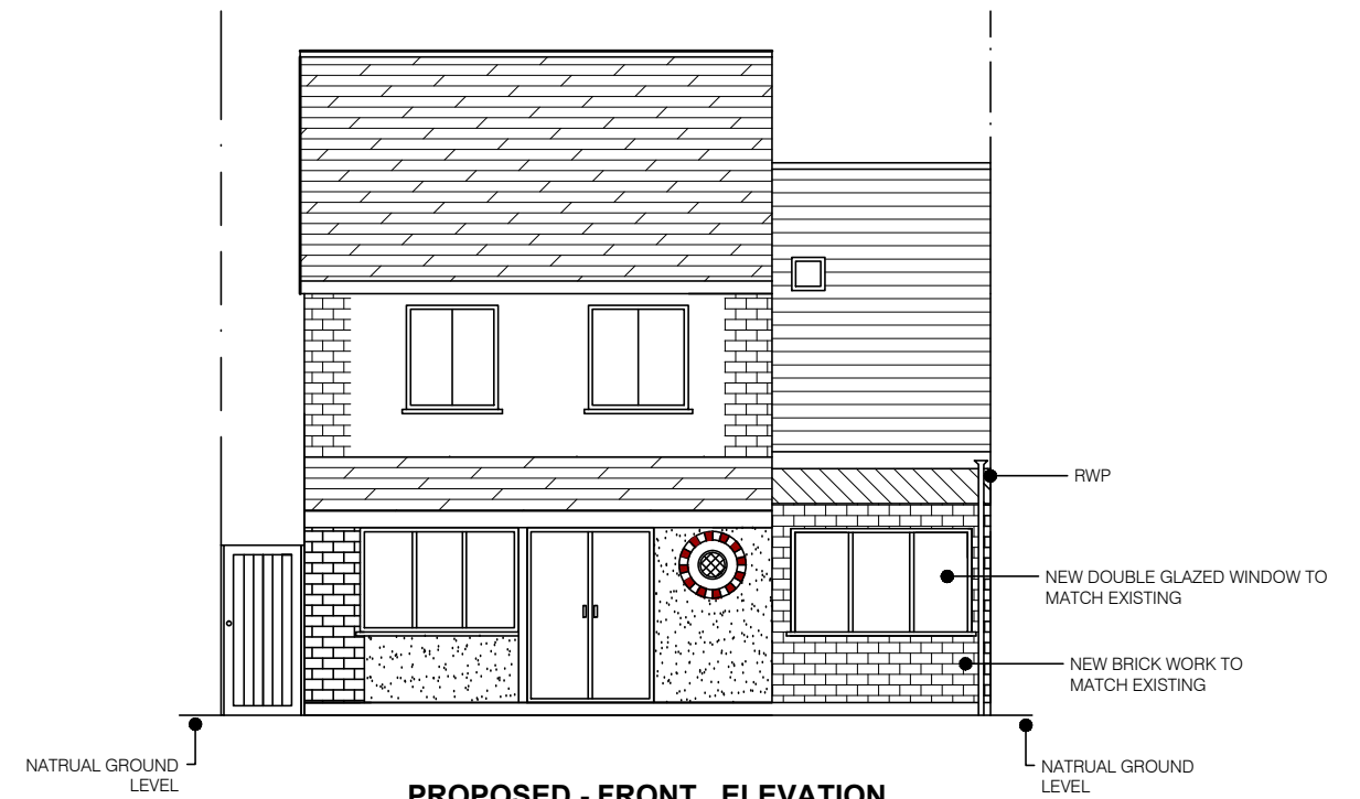
PROPOSED - FRONT ELEVATION