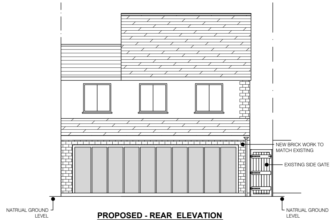
PROPOSED - REAR ELEVATION