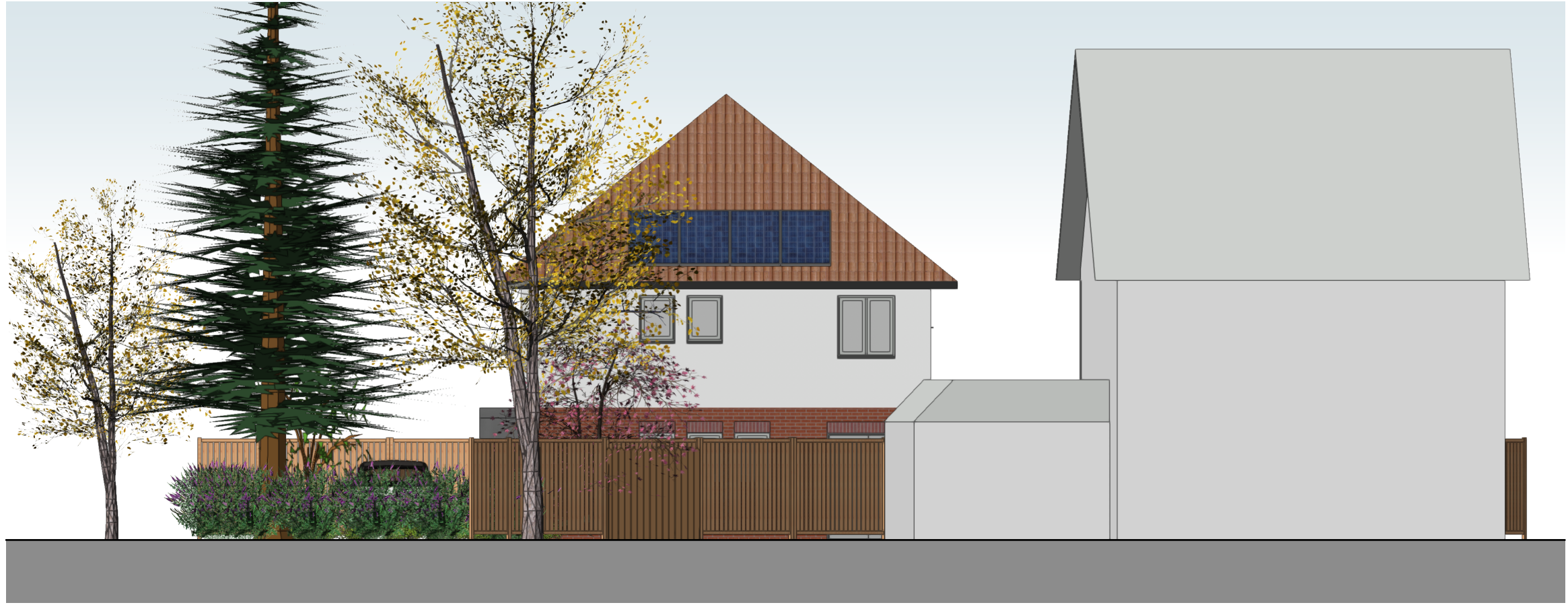
14 SOUTH/SIDE SITE CONTEXT