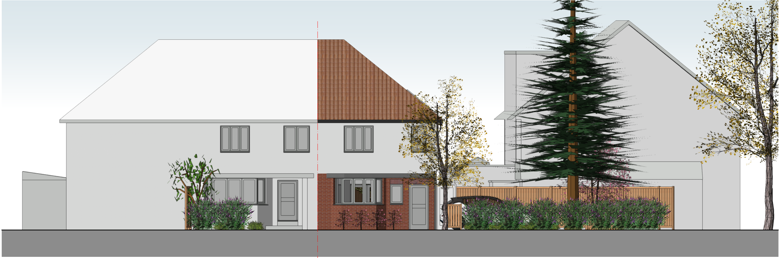
13 WEST/FRONT SITE CONTEXT