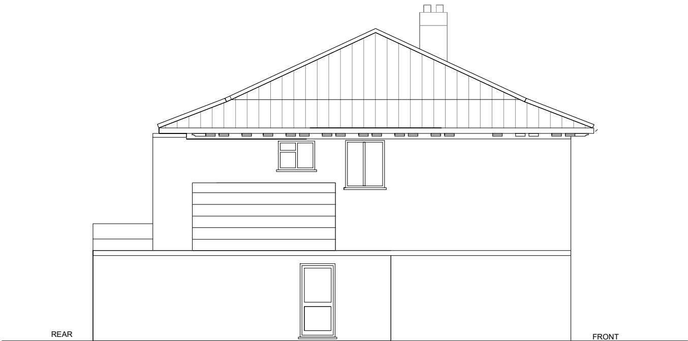
PROPOSED SIDE ELEVATION- NO. 20 SIDE

NOTES Drawings for sketch purposes only and not for construction.