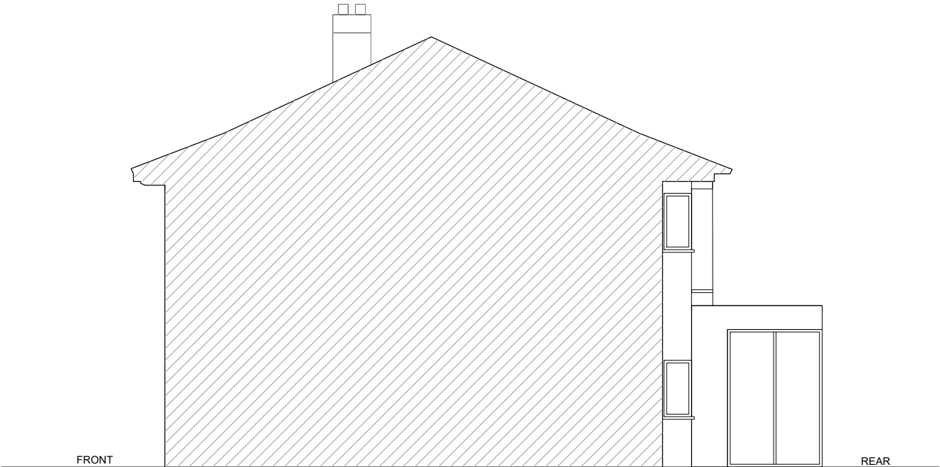
PROPOSED SIDE ELEVATION- NO.16 SIDE

NOTES Drawings for sketch purposes only and not for construction.