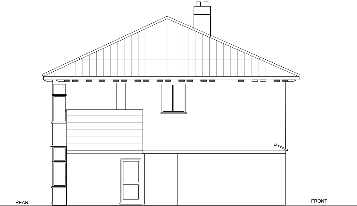
EXISTING SIDE ELEVATION-NO.20 SIDE

NOTES Drawings for sketch purposes only and not for construction.