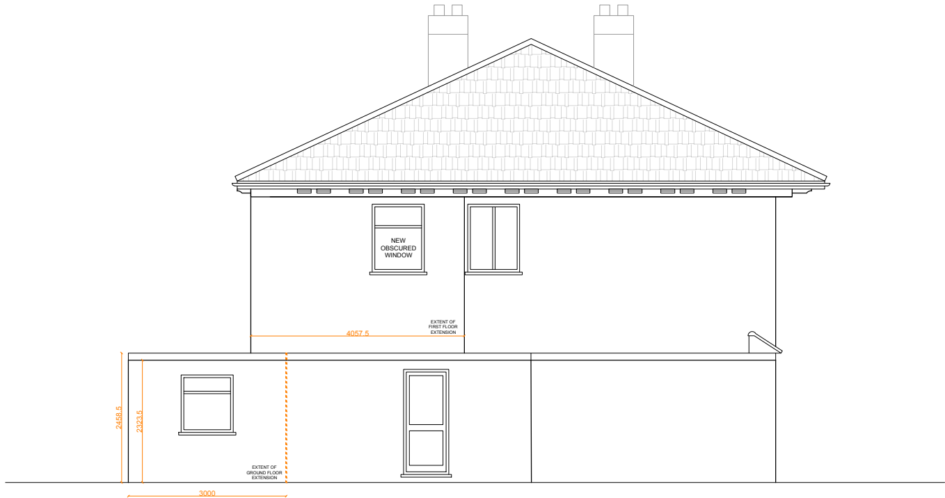
PROPOSED SIDE ELEVATION 1

NOTES Drawings for sketch purposes only and not for construction.