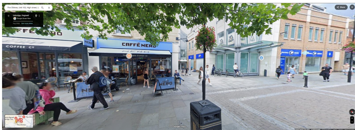
Existing Site Photos - The Chimes High street, Uxbridge, UB8 1GA, London,