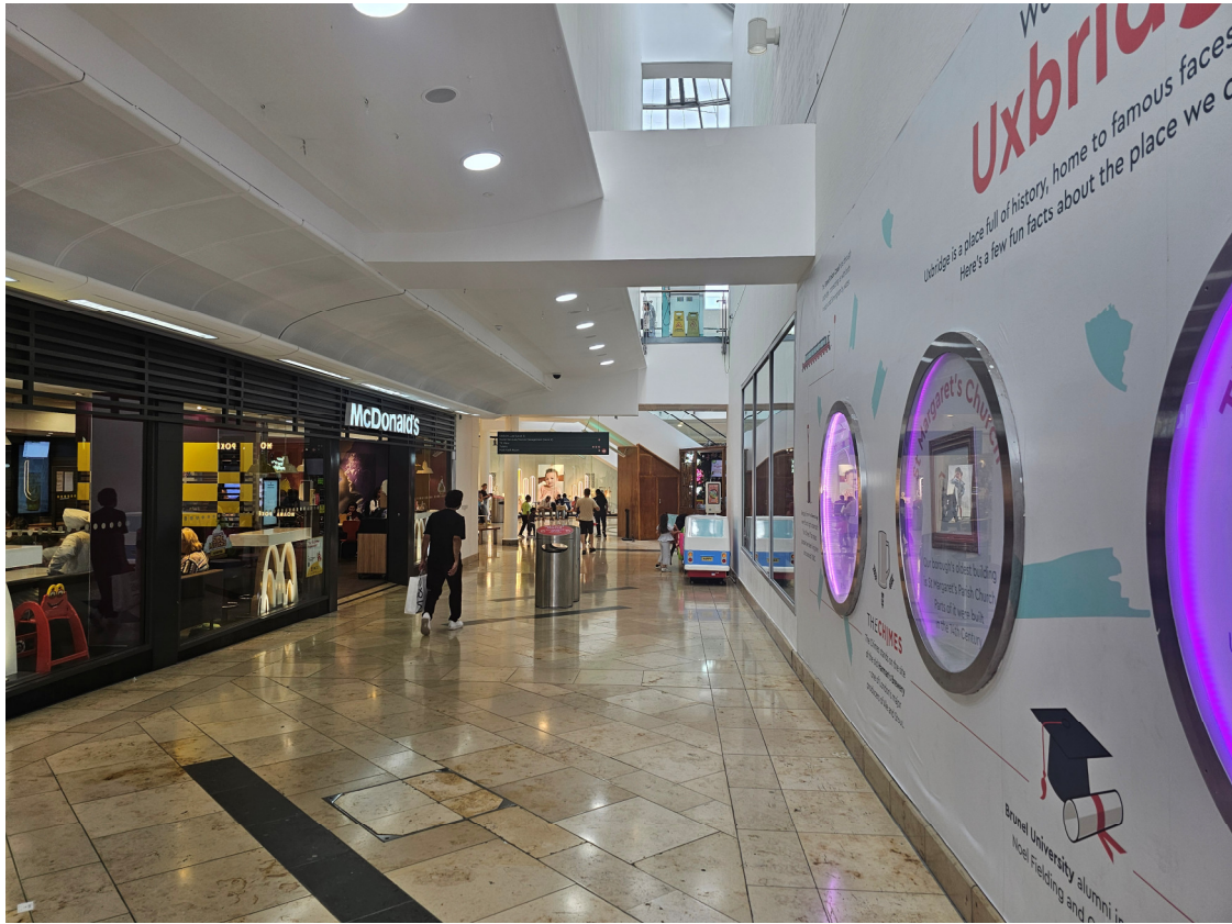
Existing Site Photos-The Chimes, Access to George St Mall Unit-102, UB8 1GA, London,