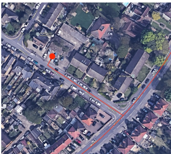
Fig.3 - Image access to Land at 31 Milman Road