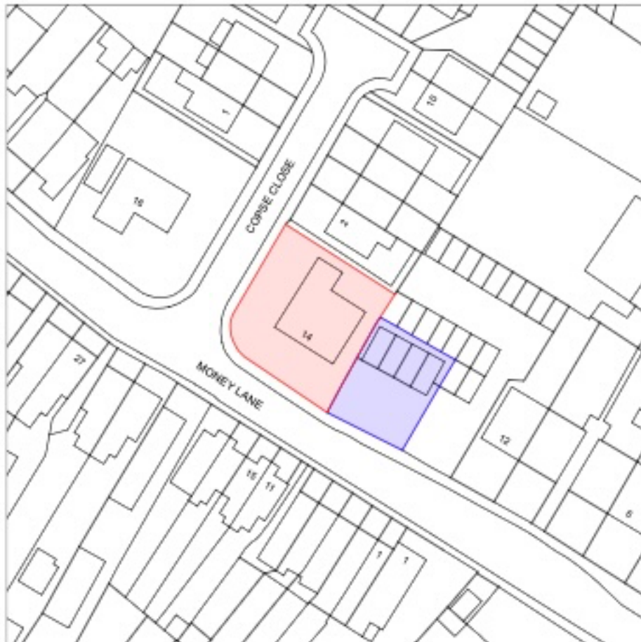
Figure 1 - Site location shaded in blue with host dwelling No.14 Money Lane, in red.