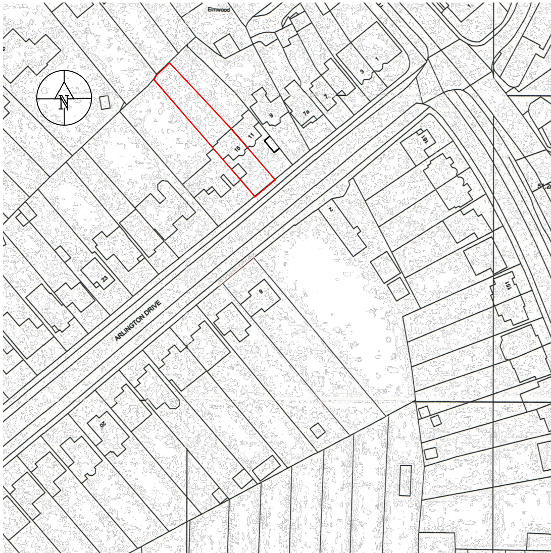
01 - OS MAP SCALE 1:1250