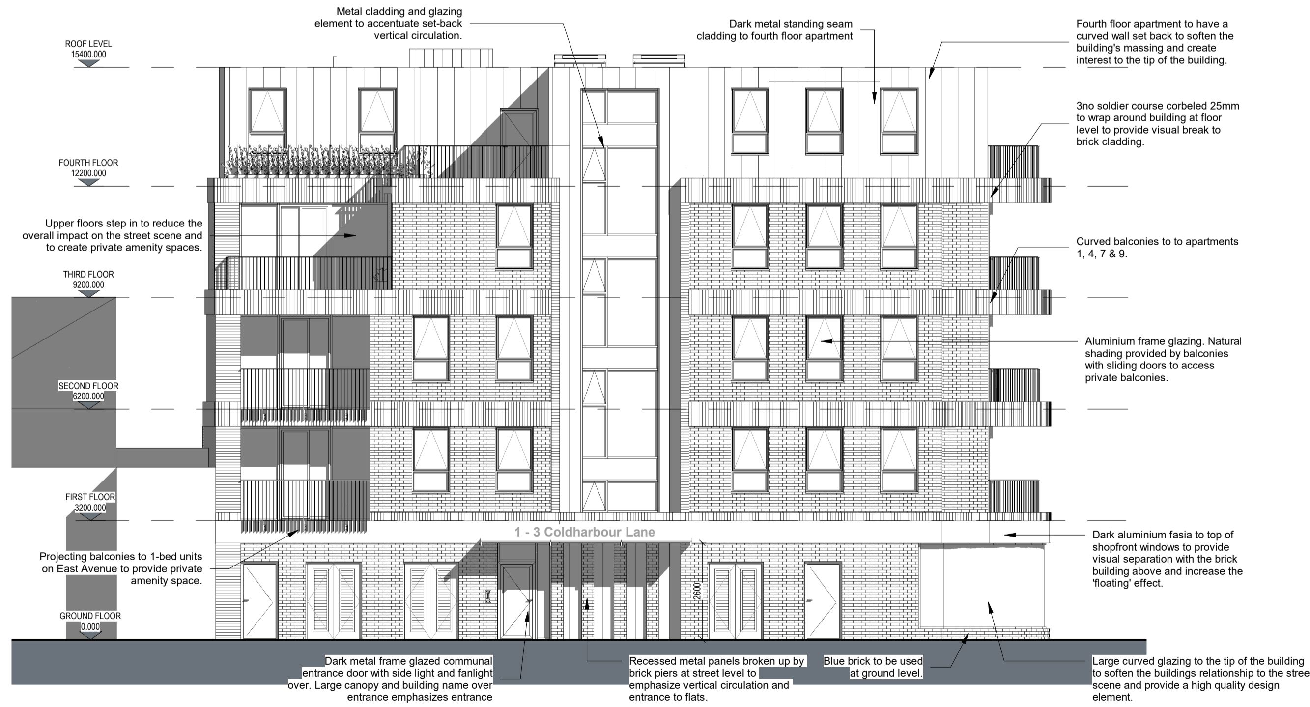
3 Proposed North Elevation 1 : 100