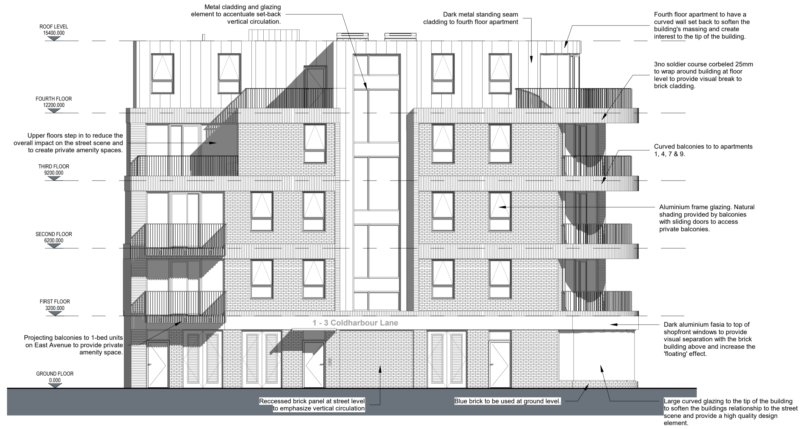
3 Proposed North Elevation 1 : 100