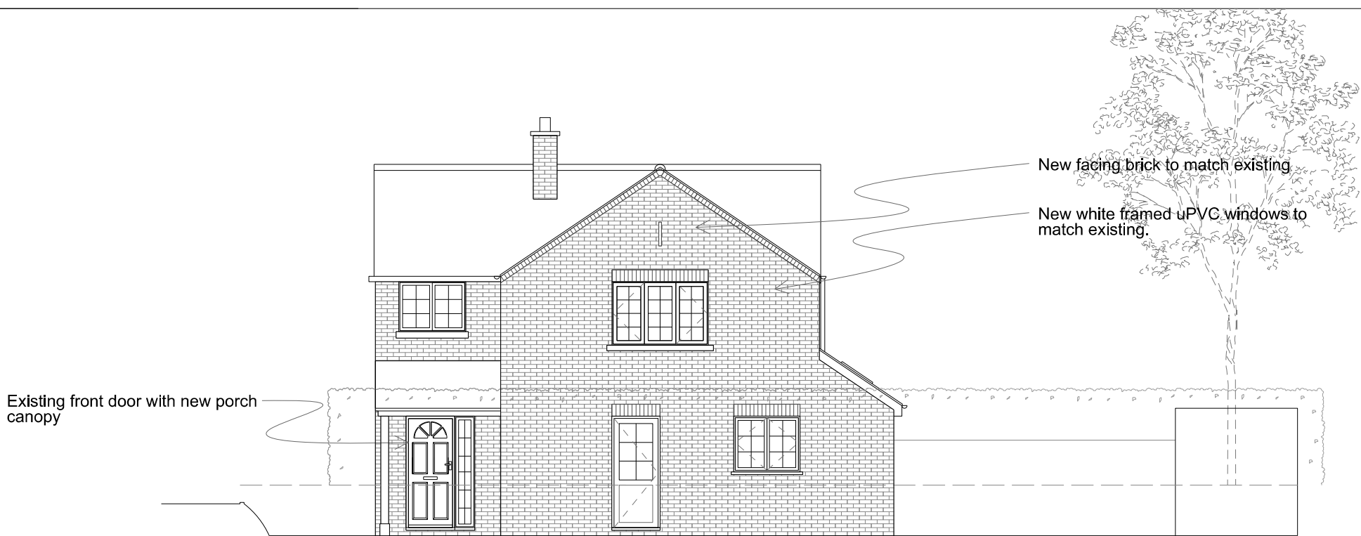
PROPOSED EAST ELEVATION View from Cordingley Road showing outline of existing hedge which will be retained.