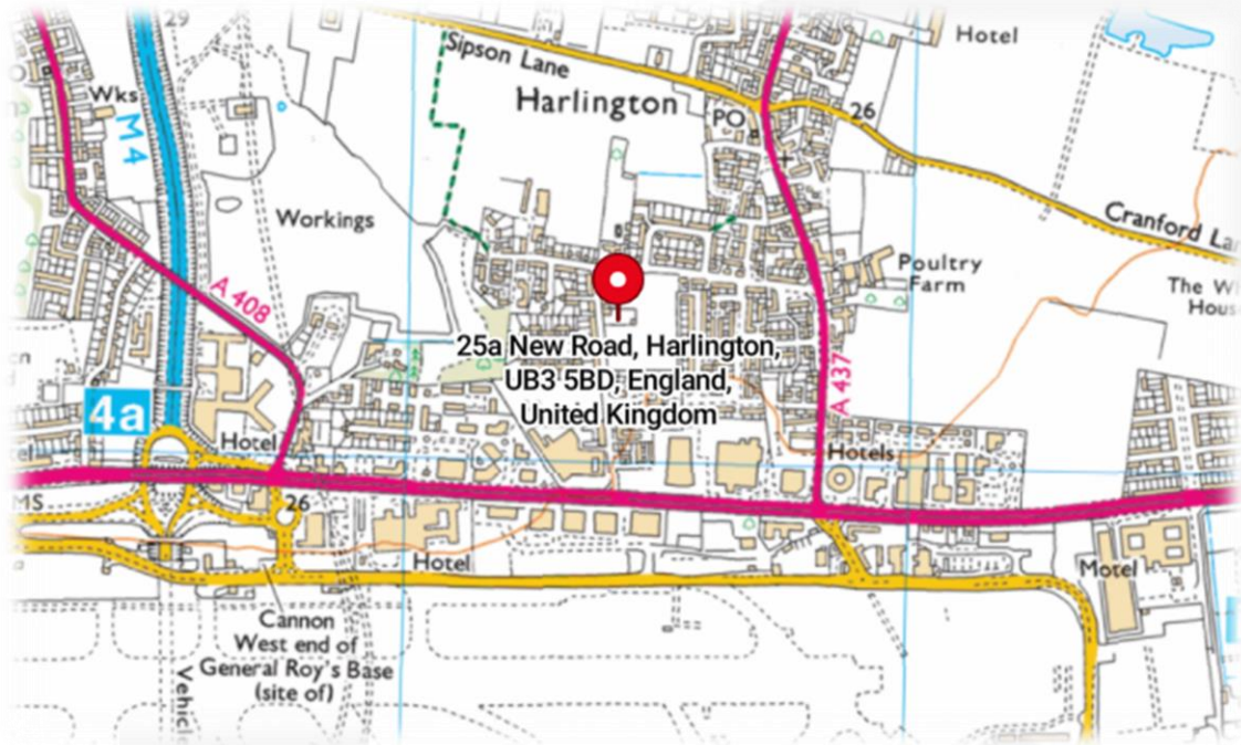
Figure 1: OS Map showing the site location (Bing Maps).

The site is in a urban residential area in West London, north of Heathrow Airport. To the east of the site is a private open field.