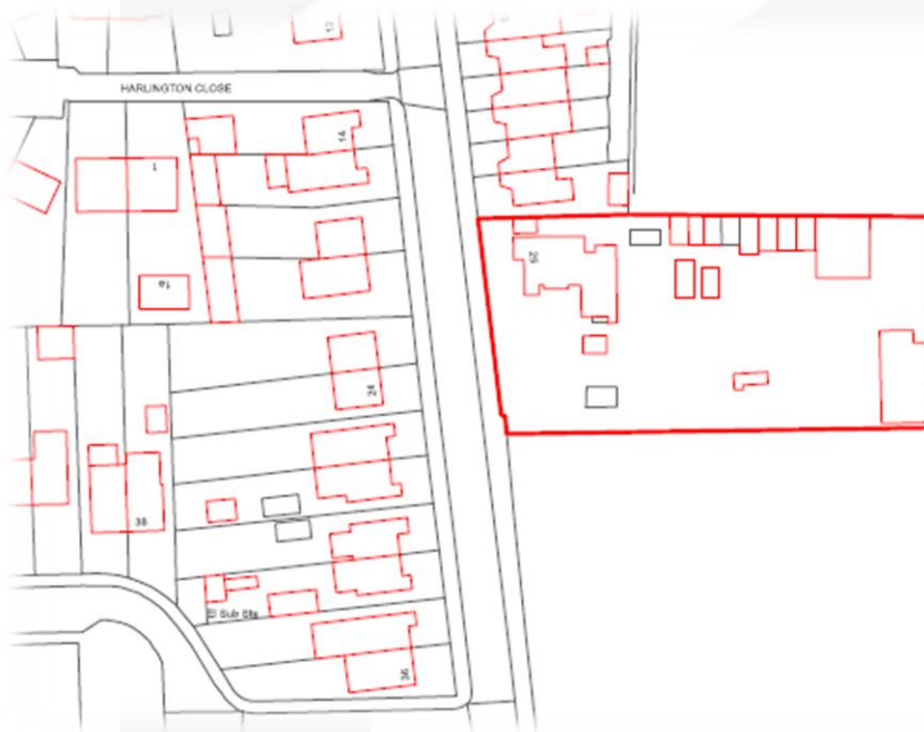
Figure 2: Location Plan, 25 New Road Harlington.