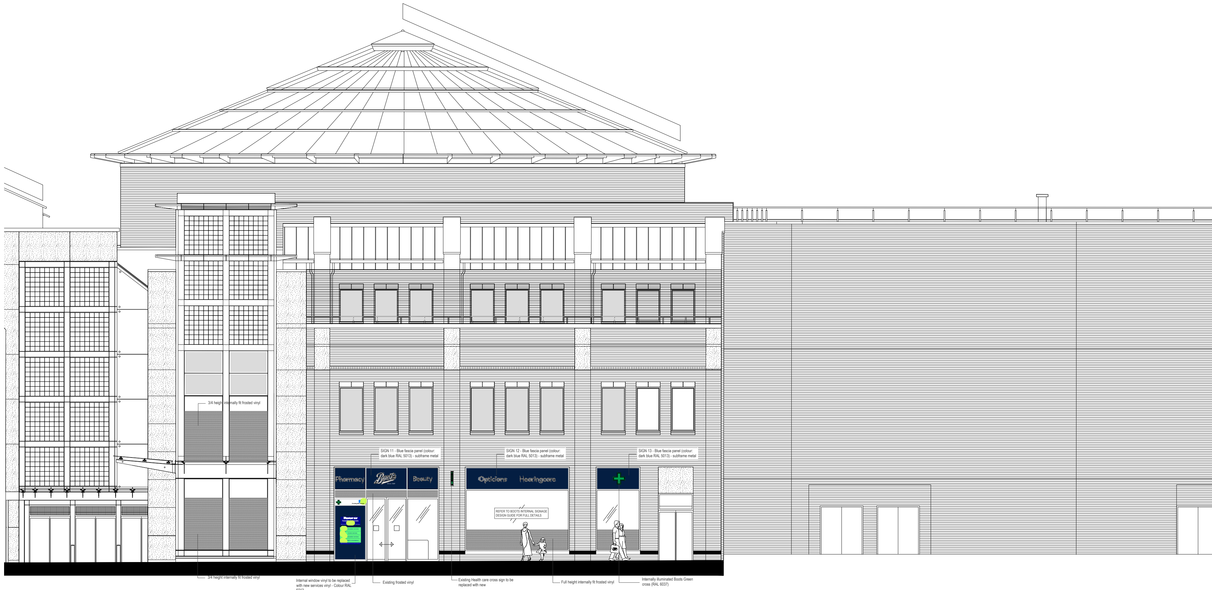
C PROPOSED EXTERNAL ELEVATION C - HIGH STREET ENTRANCE 1:100