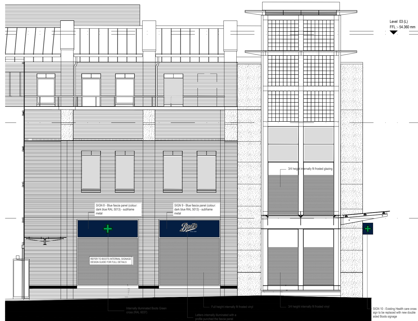
B PROPOSED EXTERNAL ELEVATION B - HIGH STREET 1:100