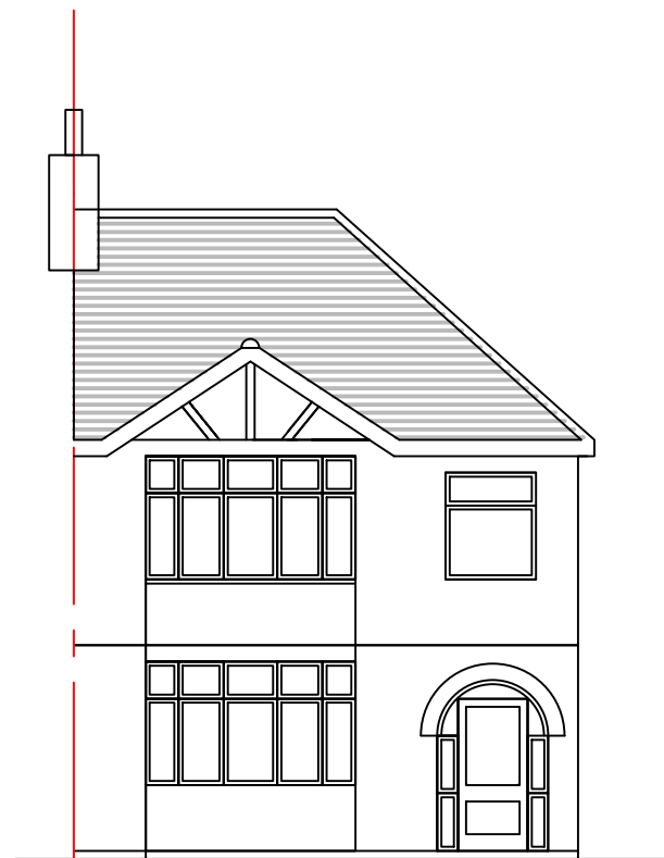
PROPOSED FRONT ELEVATION AS SAME AS EXISTING