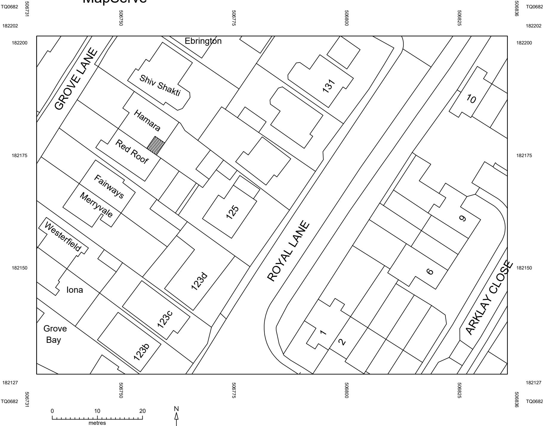
Block Plan 1 : 500