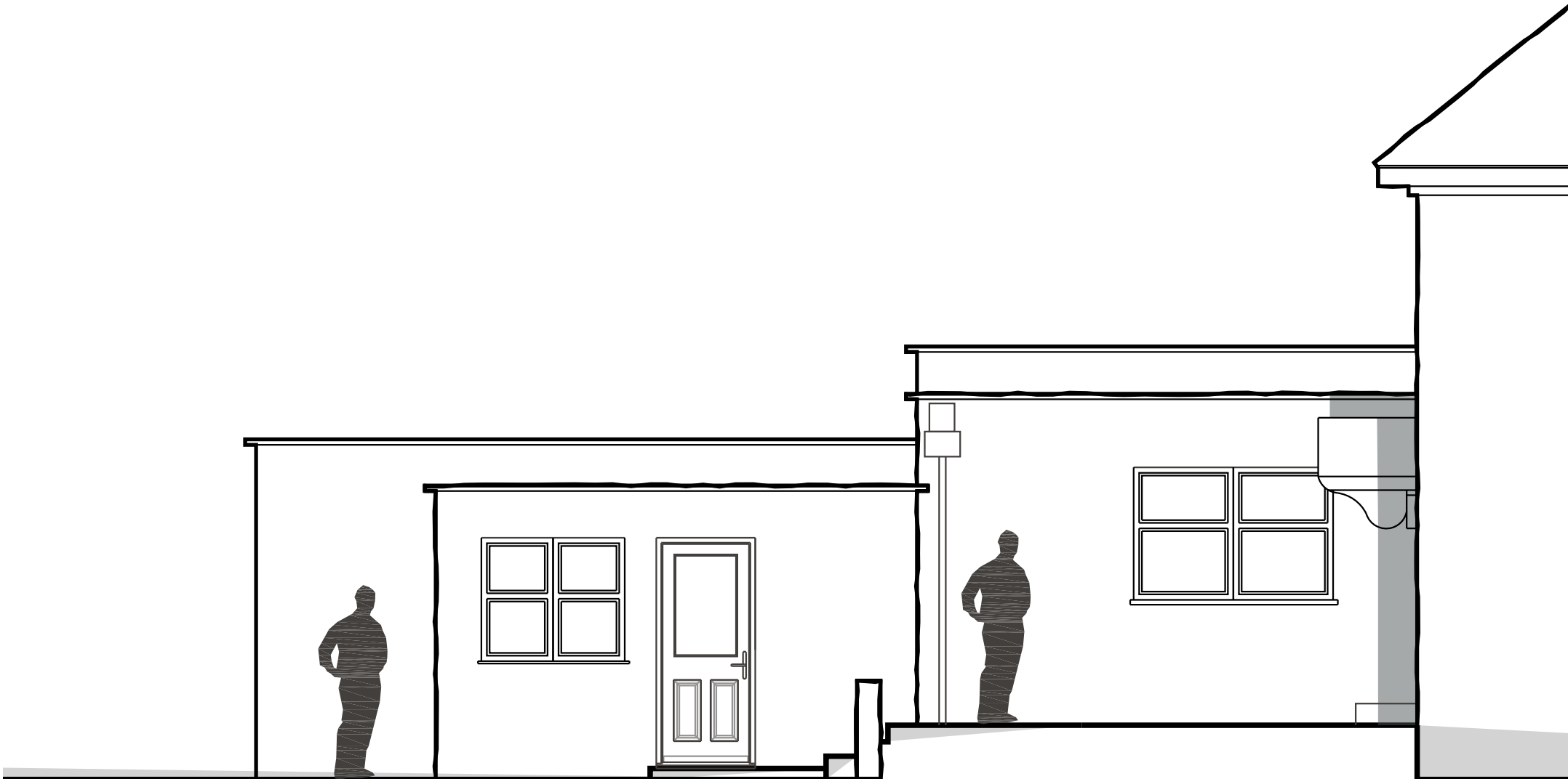
EXISTING SIDE ELEVATION scale 1:50