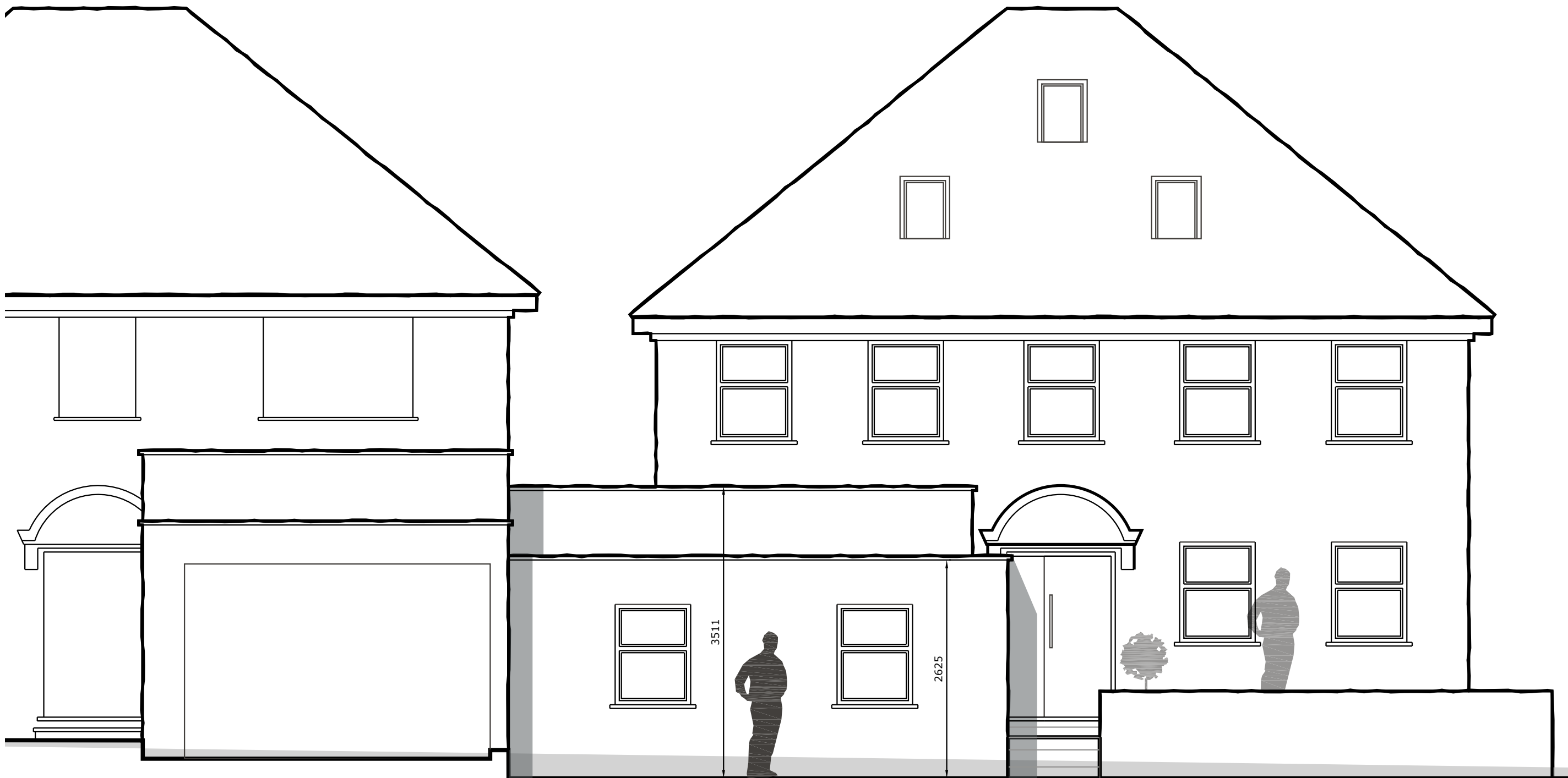
EXISTING FRONT ELEVATION scale 1:50