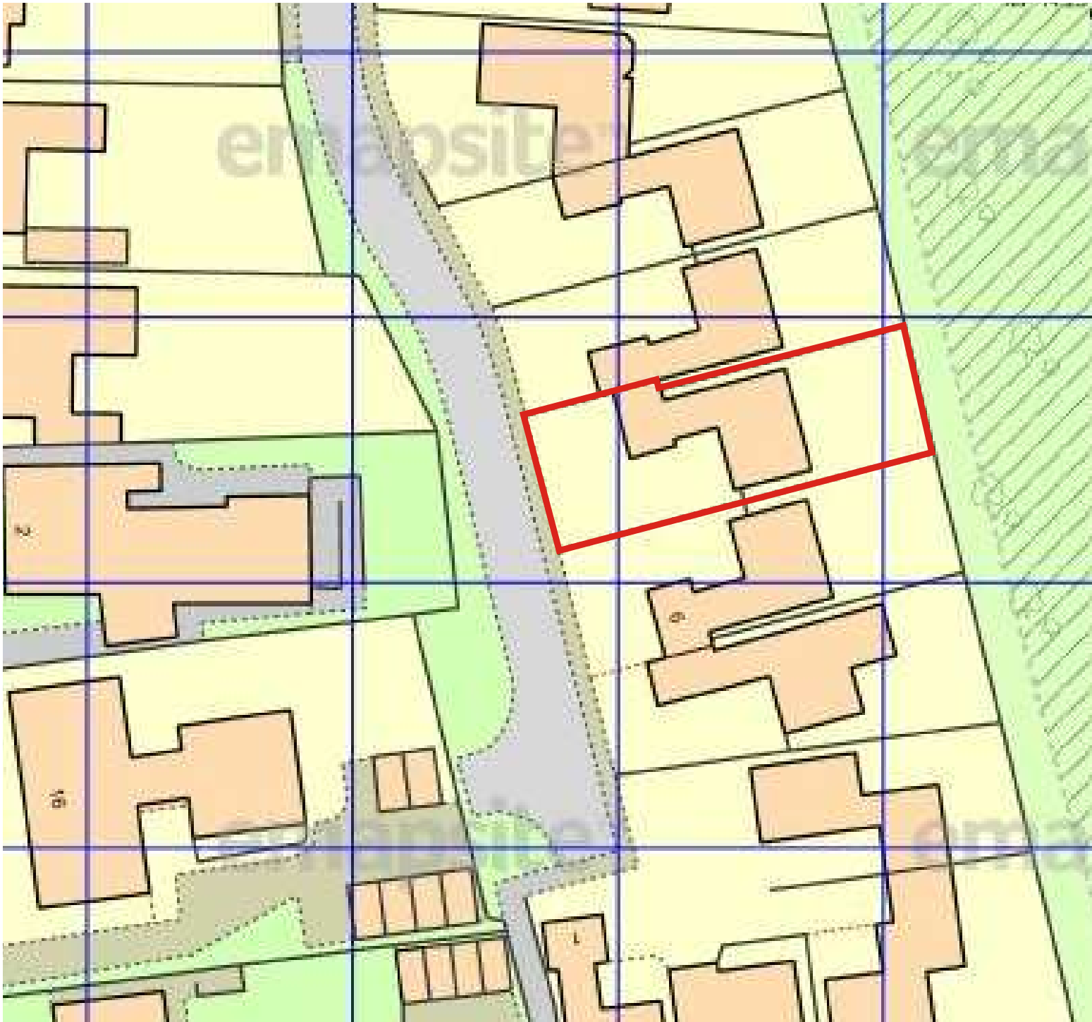
EXISTING SITE PLAN scale 1:500