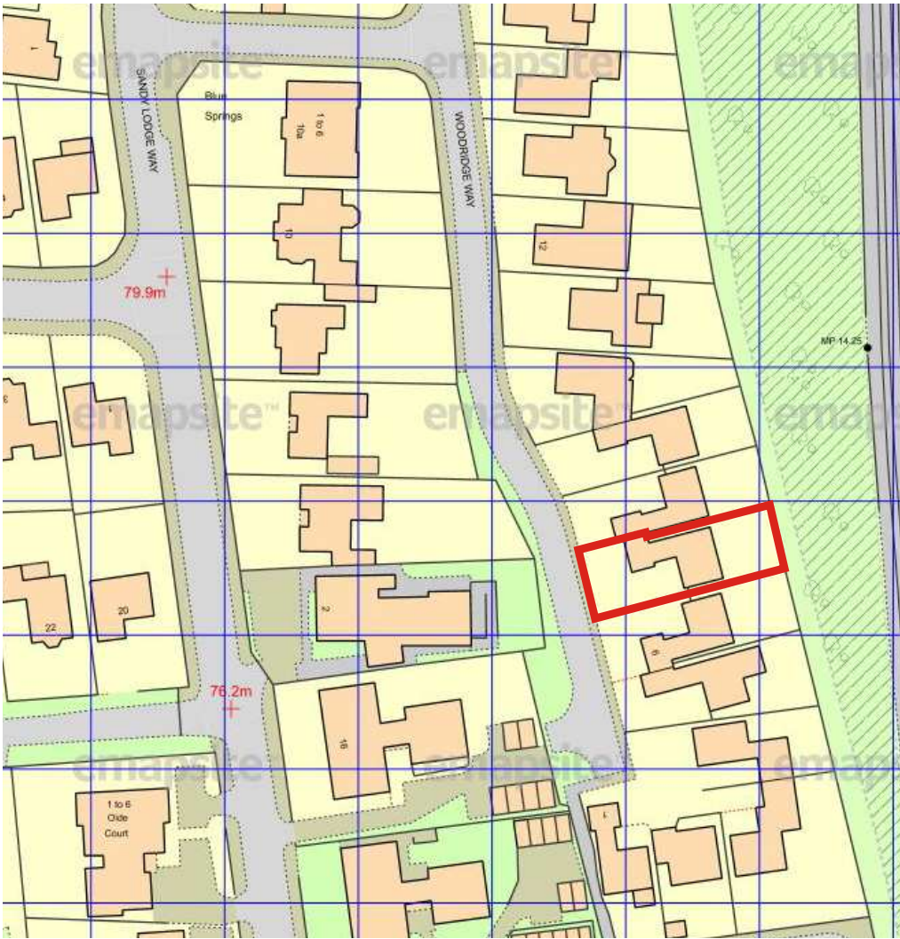
SITE LOCATION PLAN scale 1:1250