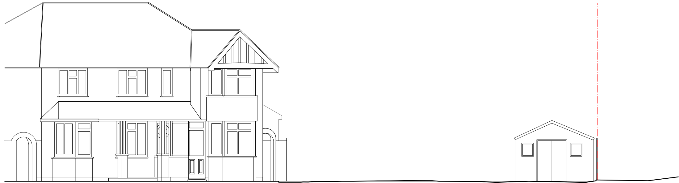
2 ELEVATION B Scale: 1:100