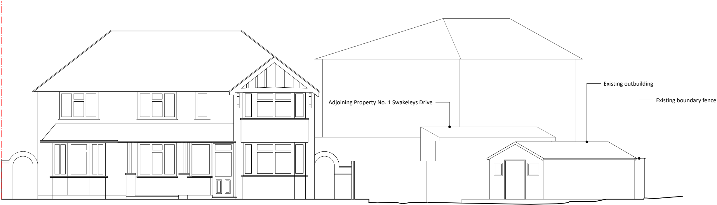
1 ELEVATION A Scale: 1:100