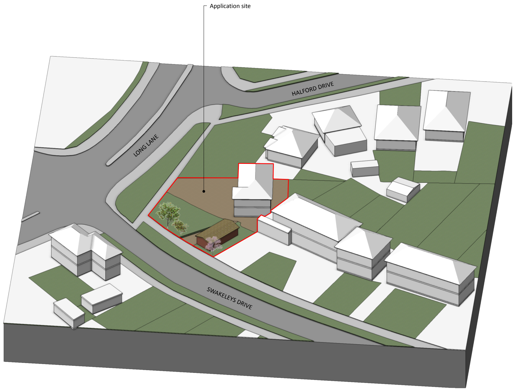
1 PROPOSED SOUTH VIEW