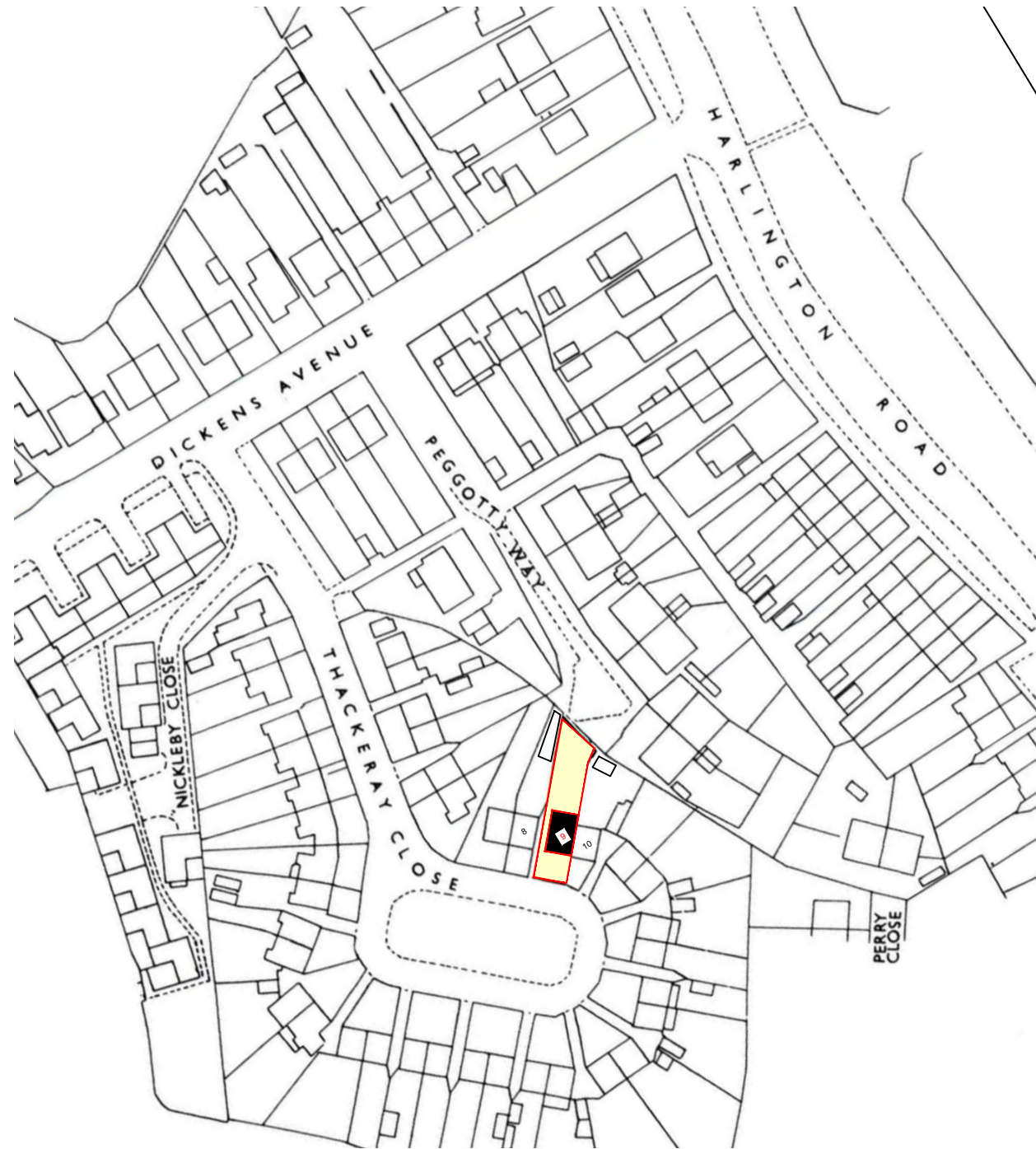
Location Map Scale: 1:1250