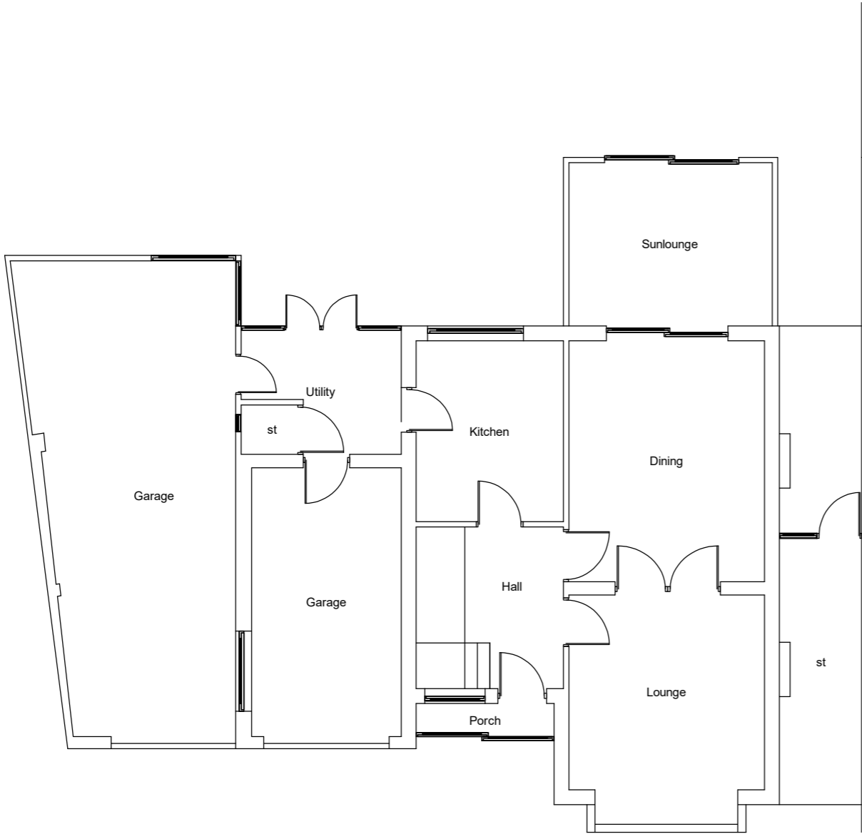
EXISTING GF & FF LAYOUT Scale 1:100

REV/NOTES: Where building to the boundaries the adjacent owner is to be informed under the terms of the Party Wall Act 1996 and its provisions followed. Where building over boundaries the adjacent owner is to be served notice under section 65 of the Town & Country Planning Act 1990. ©This drawing and the works depicted are the copyright of GT Designz LTD and may not be reproduced or amended except by written permission of GT Designz LTD.