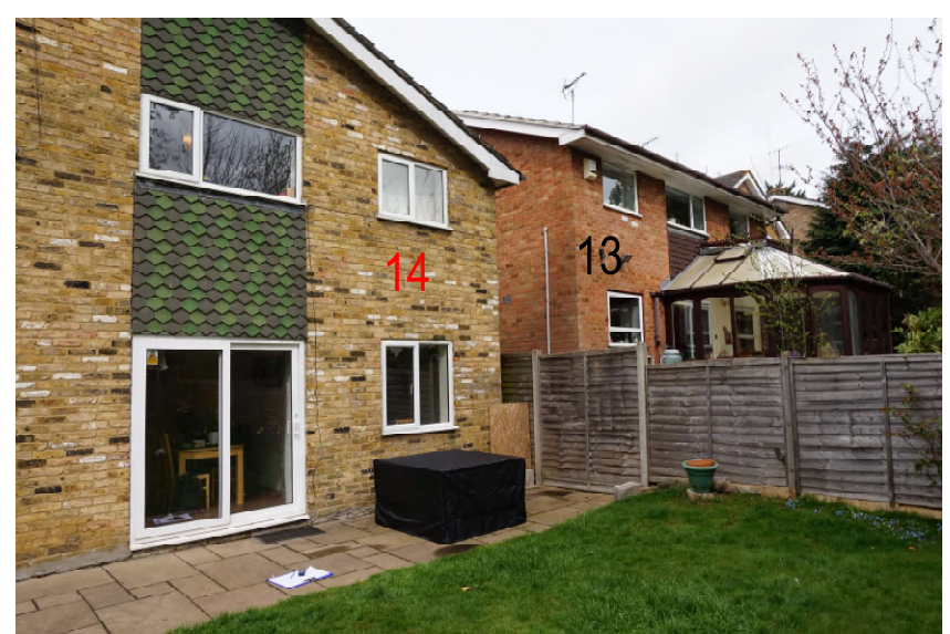
REAR PHOTOS VIEWS

Rear patio level 160mm below GL. New patio level to be the same.