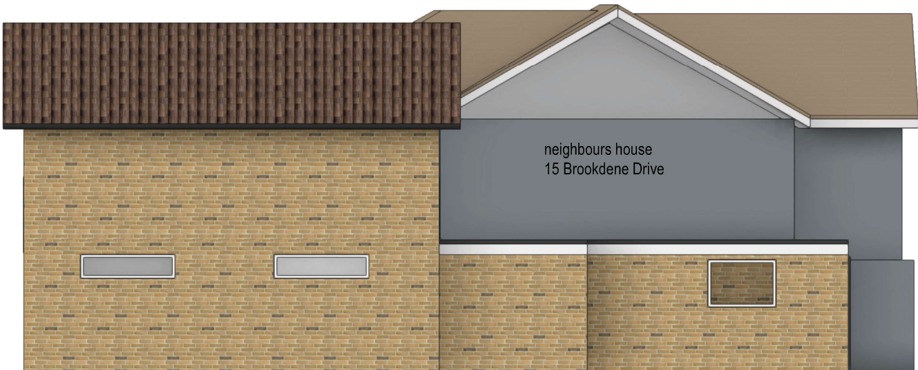
2 SIDE ELEVATION Scale: 1:100

Windows - White UPVc Doors - White UPVc RWP & Gutters - UPVc black