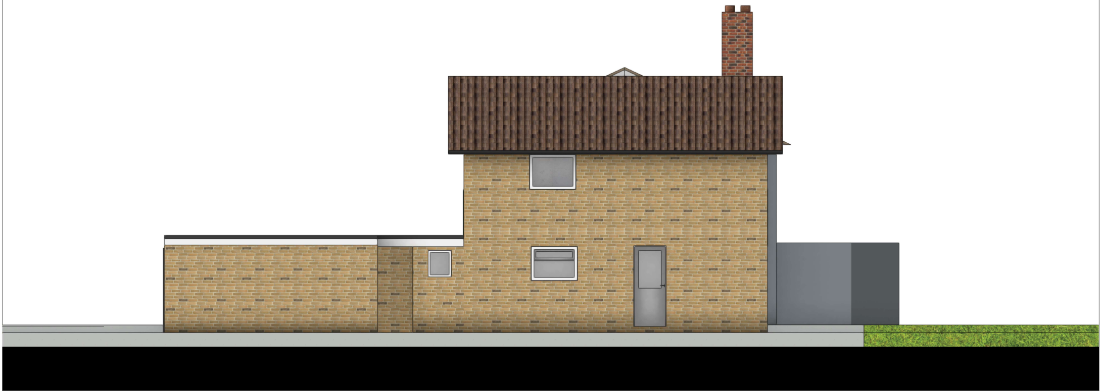
1 SIDE ELEVATION Scale: 1:100

Roof - Red/brown roof tiles Walls - Facing brickwork