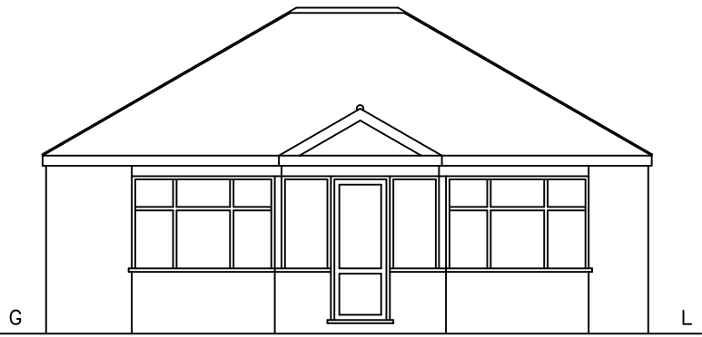
PROPOSED FRONT (WEST) ELEVATION