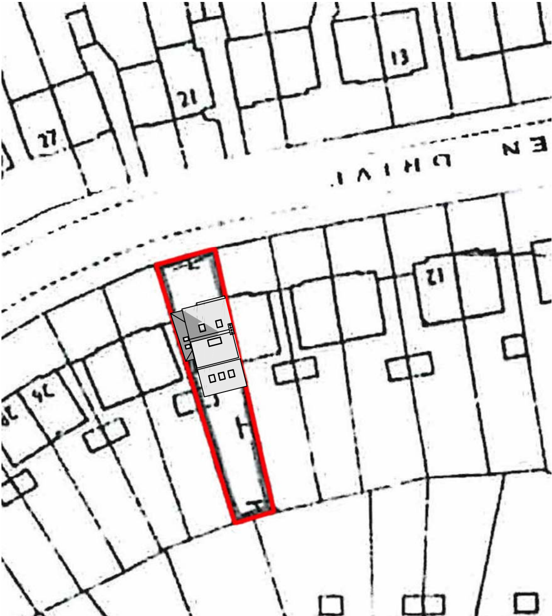
PROPOSED BLOCK PLAN SCALE 1:500 @ A3