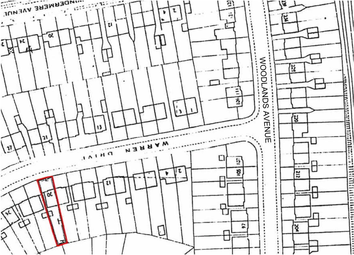
SITE LOCATION PLAN SCALE 1:1250 @ A3