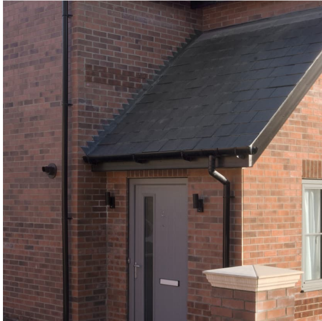
Details of brickwork fenestration

Details of brickwork fenestration and surface materials