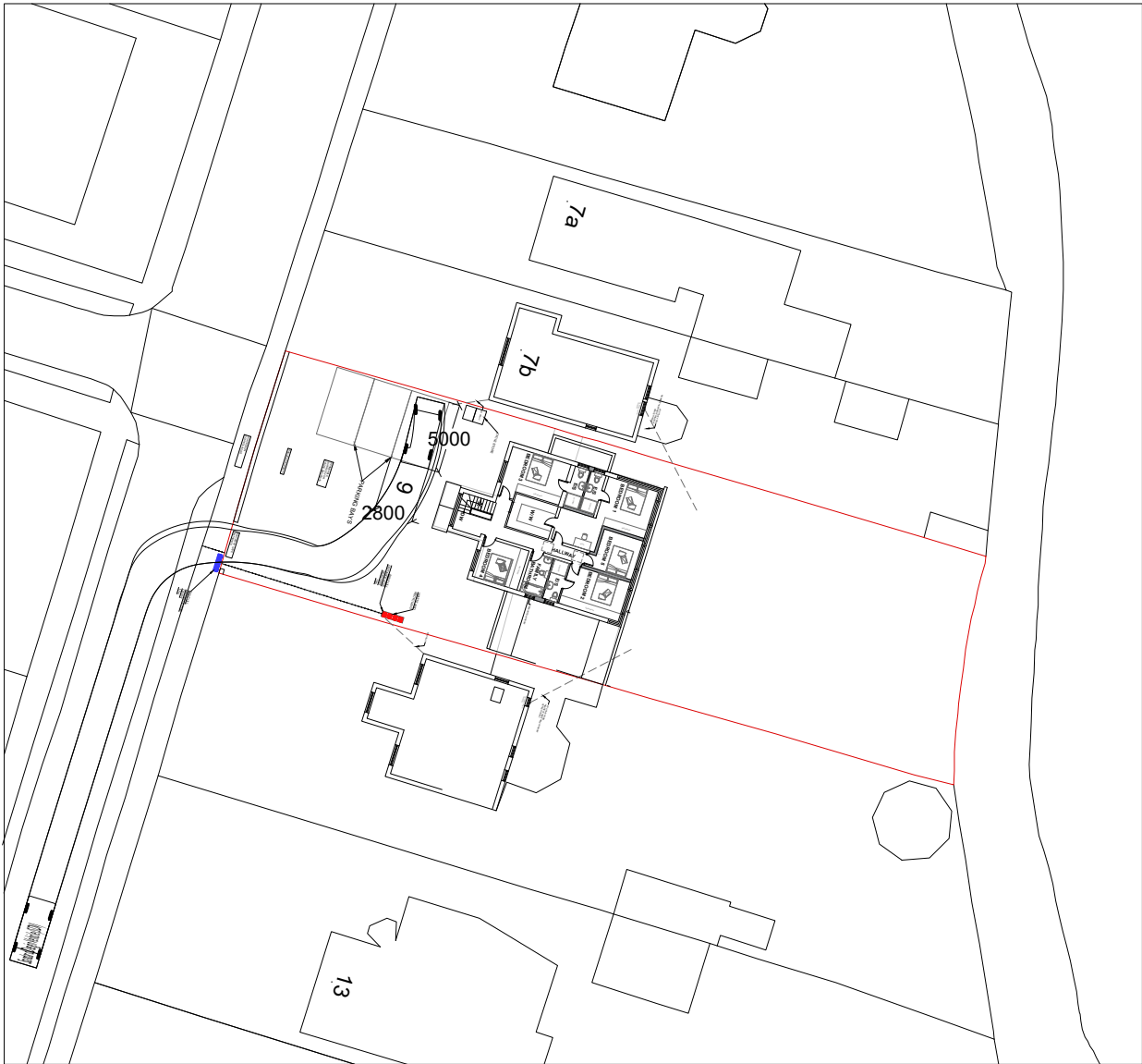
PROPOSED SITE PLAN SCALE 1:500

Crown Copyright and database rights 2022 OS Licence no. AC0000849896