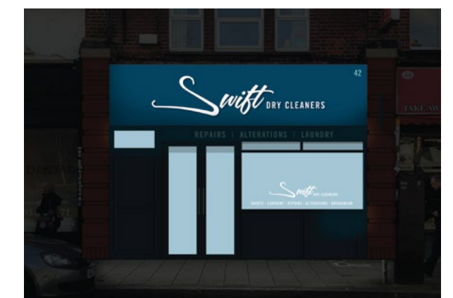
LIGHTING AT NIGHT