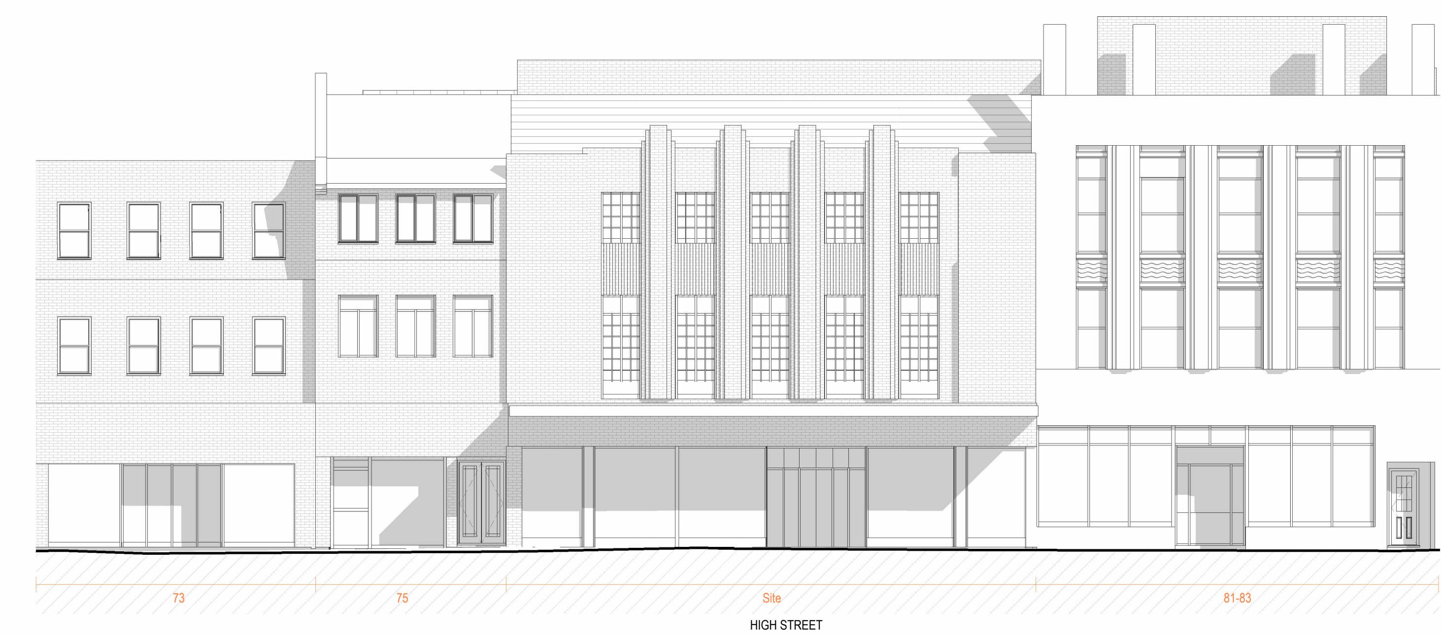
South-West Elevation 1 : 100