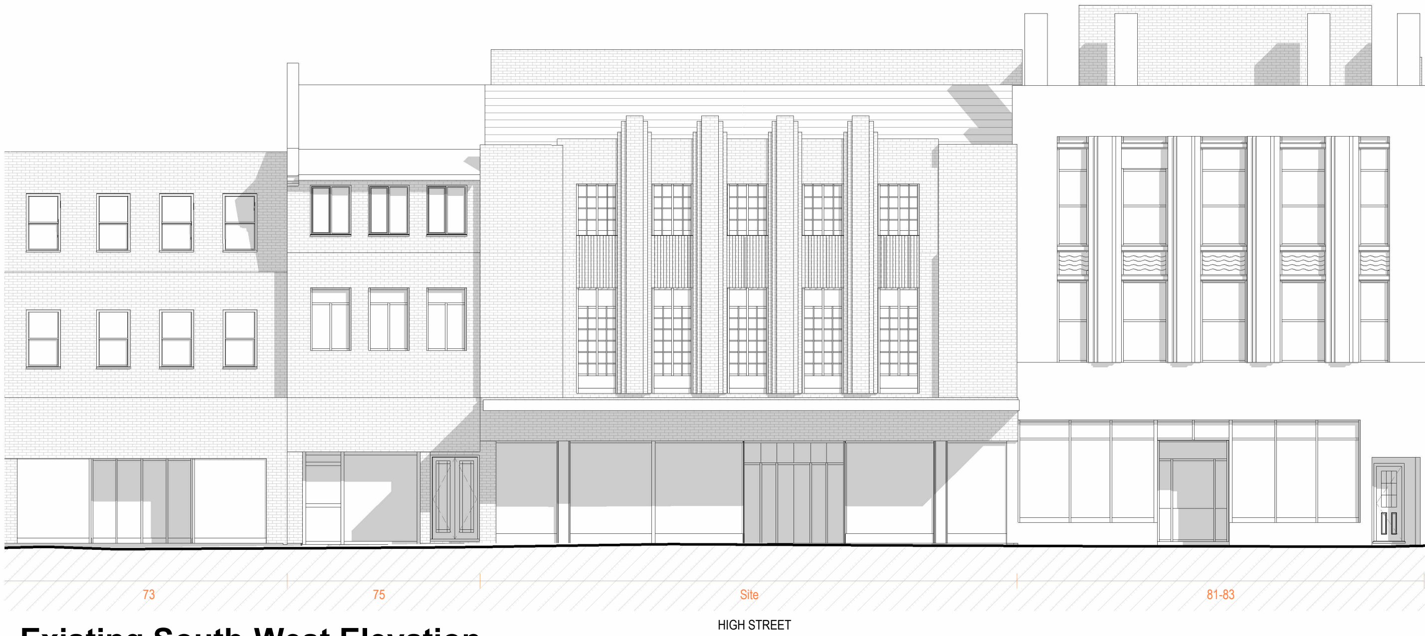
Existing South-West Elevation 1 : 100