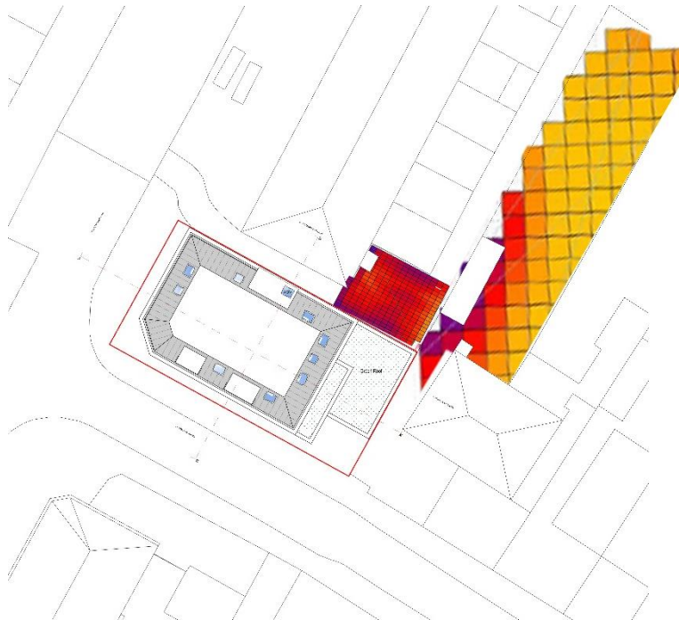
Figure 2 – Open spaces