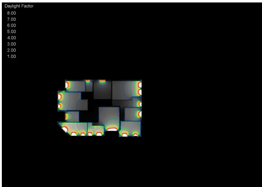
Figure 7 – Proposed habitable rooms at second floor