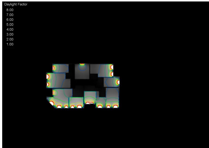
Figure 6 – Proposed habitable rooms at first floor