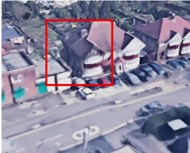
Figure 5 – Neighbouring Windows at No 1 Fairdale Gardens (Numbering from left to right)