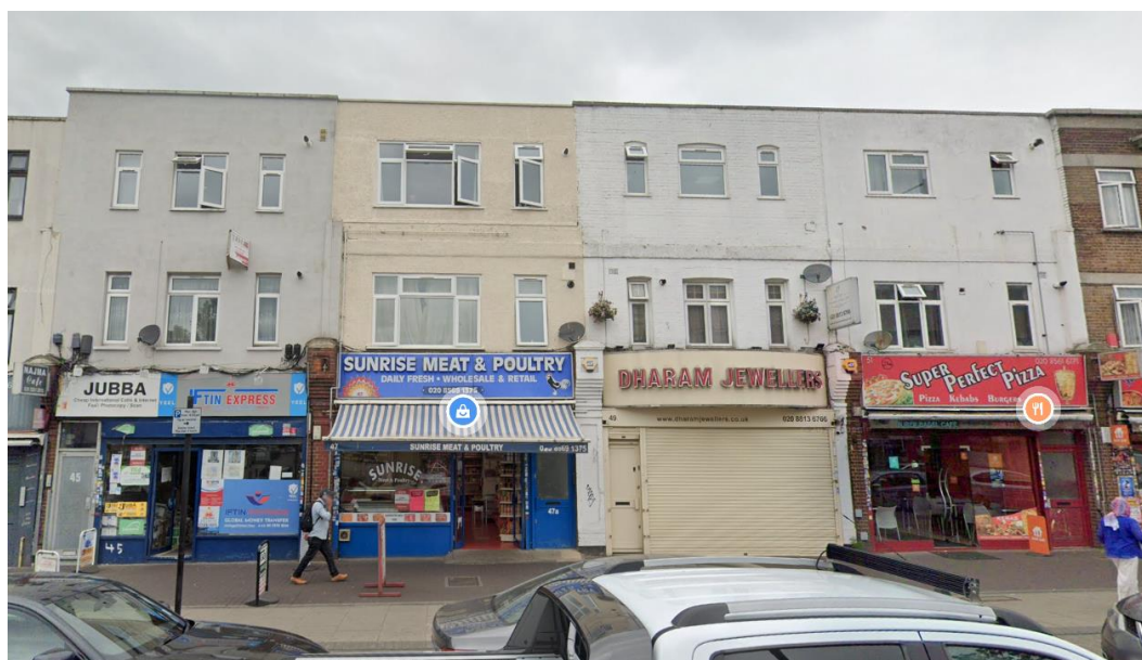
Figure 8 – Neighbouring Windows at No 45, 47, 49, 51 Coldharbour Lane (Numbering from left to right)