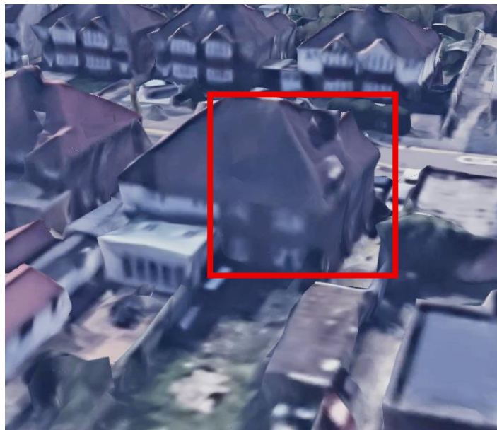
Figure 6 – Neighbouring Windows at No 1 Fairdale Gardens (Numbering from left to right)