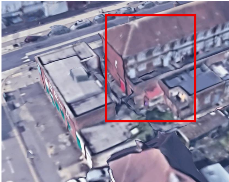
Figure 4 – Neighbouring windows at No 84 & 86 Coldharbour Lane (Numbering from left to right)