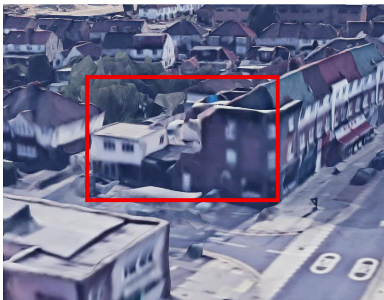
Figure 7 – Neighbouring Windows at No 50 Coldharbour Lane (Numbering from left to right)