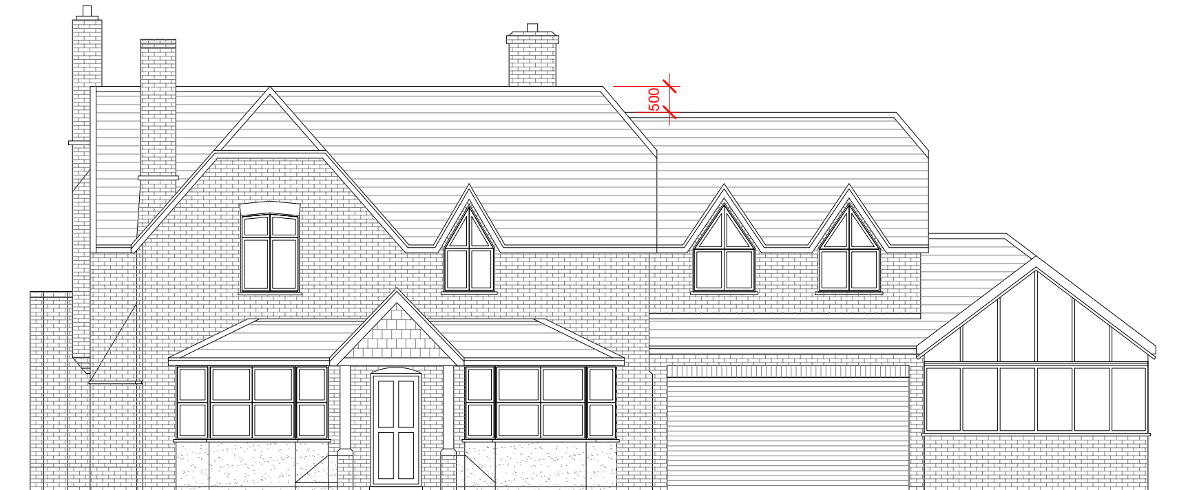
proposed Front Elevation Scale 1:100

Proposed External Finish Materials to Match Existing External Finish Materials Proposed Flank Wall Window to be Obscure Glazed and Non Opening below 1.7m from FFL