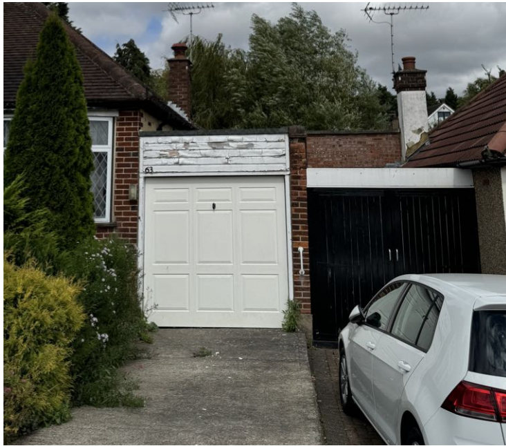
FRONT ELEVATION OF 63 STANLEY ROAD SHOWING THE GARAGE