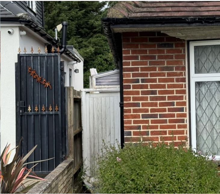
SIDE PASSAGEWAY BETWEEN 63 & 61 STANLEY ROAD TAKEN FROM STANLEY ROAD