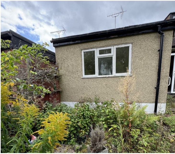
63 STANLEY ROAD REAR OUTRIGGER TAKEN FROM THE REAR GARDEN