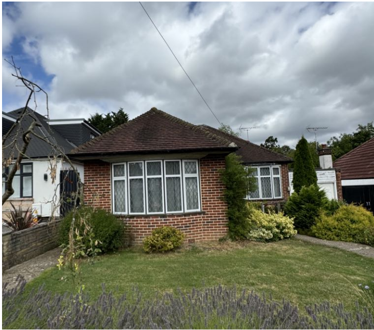
FRONT ELEVATION OF 63 STANLEY ROAD TAKEN FROM STANLEY ROAD