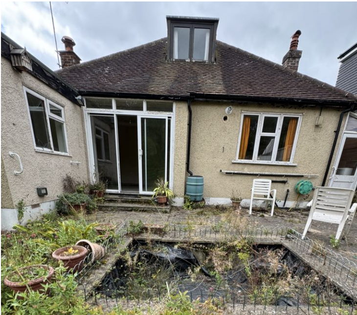
REAR ELEVATION OF 63 STANLEY ROAD TAKEN FROM REAR GARDEN