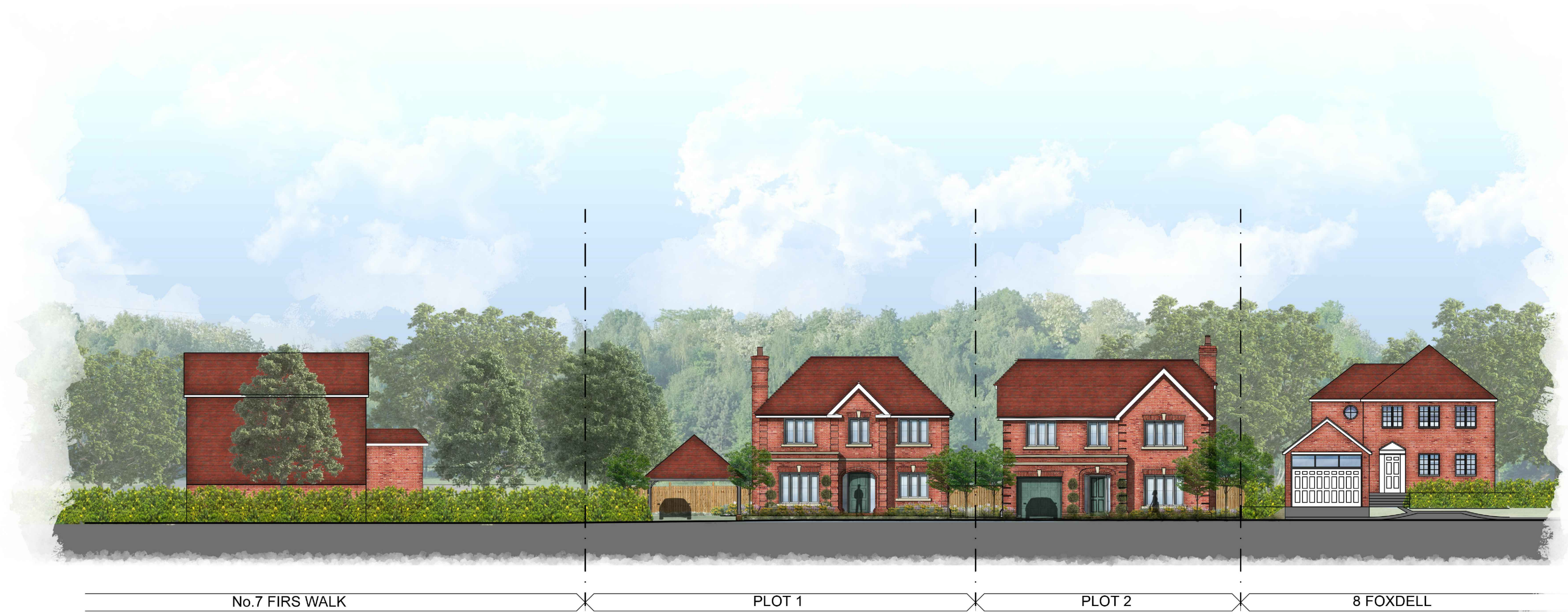
STREET SCENE SECTION A-A 1:200