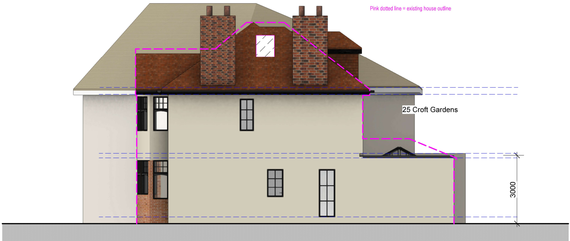
1 02 PROP ELEV SIDE Scale: 1:100