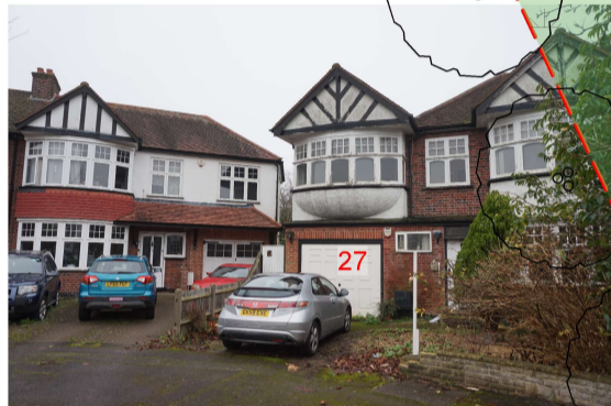
Images of front of property showing damaged boundary wall dead lawn/grass area and damaged driveway slabs