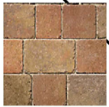
Patio/Driveway Autumn Wobern Rumbled or similar permeable paving to be used

□ Crossing extension to conform to the council's maximum allowable width for crossing provisions as stipulated within the council's 'Domestic Vehicle Footway Crossover' Policy (2022).