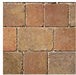
Patio/Driveway Autumn Wobern Rumbled or similar permeable paving to be used

SOAKWAYS attenuated crates To be designed for 1m3 for every 16m2 of roof serving it. Not less than 5 m. from buildings. Depth 600 mm below invert level of drains. Use modular attenuation cells of lightweight plastic structure with a high void ratio. Beneath the unit & on all sides provide 100mm of gravel and on top 500mm cover including 100mm gravel layer. Size of the hole to be 1600mm deep and 1200mm sq. Pipe to 100mm dia and 1: 40 fall. Where the pipe enters the soakaway it should be surrounded by gravel. All to meet building inspectors approval on site.