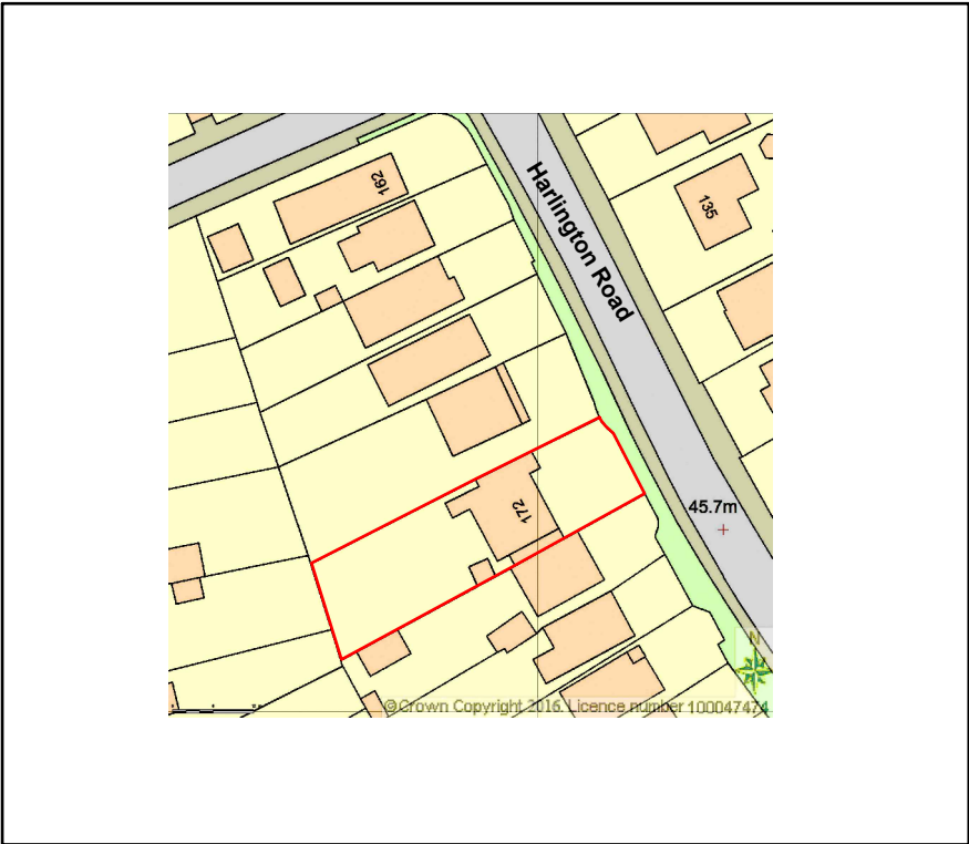
Location Plan@ 1:1250

Single Storey Rear Extension, Conversion of garage into habitable room along with Change of Use to Sui-Generis (HMO)