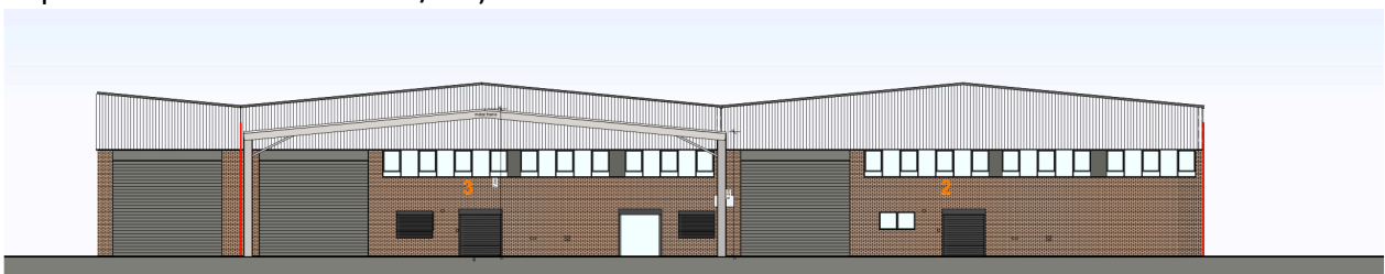
1 Proposed Front Elevation(South) Scale: 1:100

The structure is subordinate to the main building and remains below the existing roof ridge (see Proposed Elevations 2608 PL1/08 )